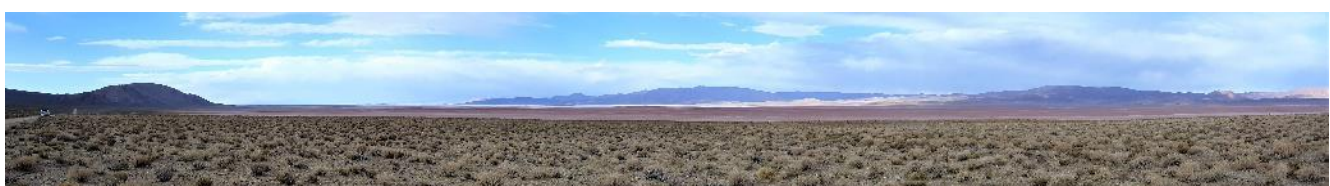
Figure 1 a,b,c,d: Lake's Cauchari Lithium Project – View looking north west from first diamond drill hole across the Cauchari salt lake towards adjoining Ganfeng Lithium / Lithium Americas resource and Orocobre / Advantage Lithium resource. Diamond drill rig looking east (Hole #1) and Rotary drill rig looking east (Hole #2). View of drilling area.