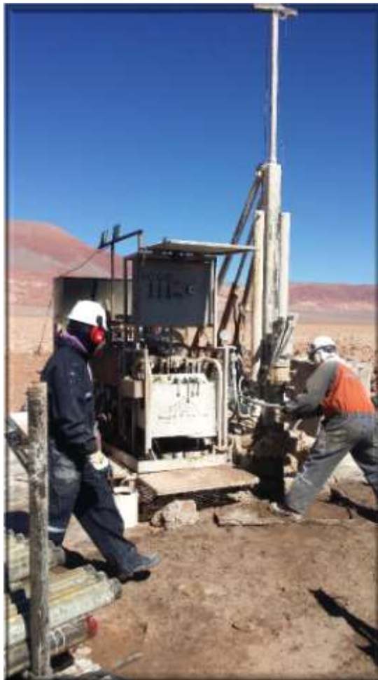
Images of the diamond drill rig at the first and second drill holes of the Kachi project