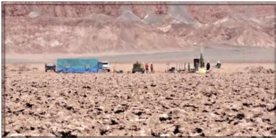
Images of the diamond drill rig at the second drill hole of the Kachi project