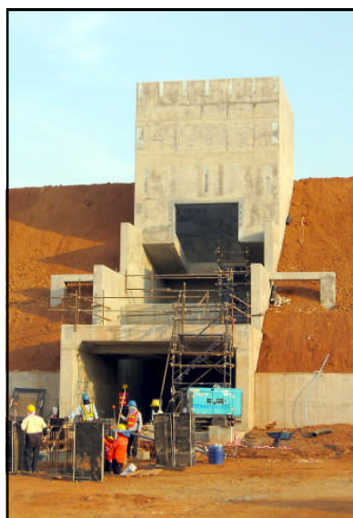
Primary Crusher (No.2) under construction

For the half year, unrealised non-cash foreign exchange losses on intercompany loans and costs associated with the two outstanding corporate transactions are expected to have an adverse impact of around A$13 million on the December 2010 half year profit.