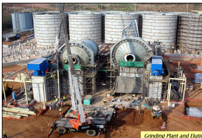
Grinding Plant and Elution Tanks under construction