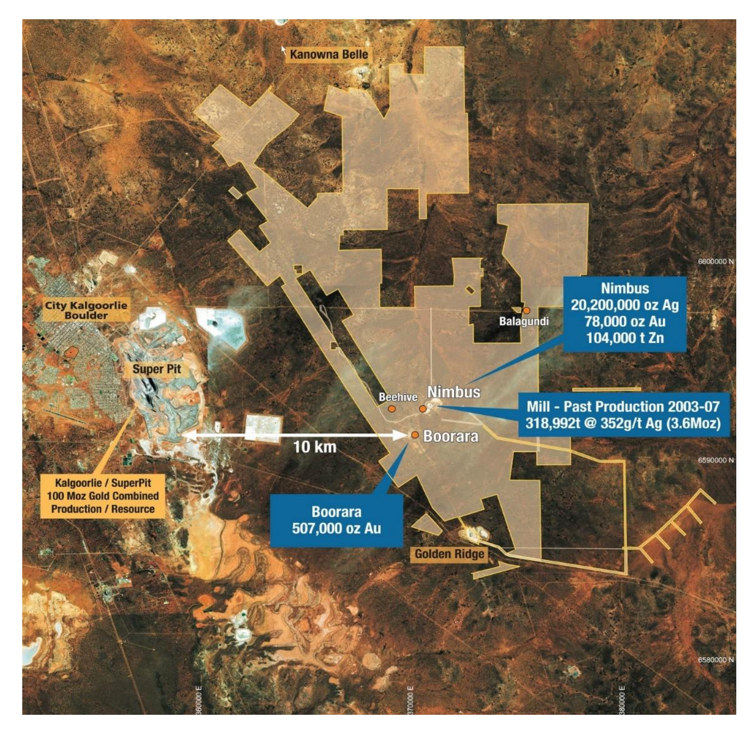
Figure 2: MacPhersons gold project locations and surrounding infrastructure

Intermin and MacPhersons are pleased to announce the signing of a Merger Implementation Agreement ( MIA ) to combine the two companies by way of a Scheme of Arrangement, subject to MacPhersons shareholder and court approval. The combined gold projects cover a total area of 1,100km<sup>2</sup> in close proximity to Kalgoorlie-Boulder in the world class Western Australian goldfields (Figures 1 and 2).