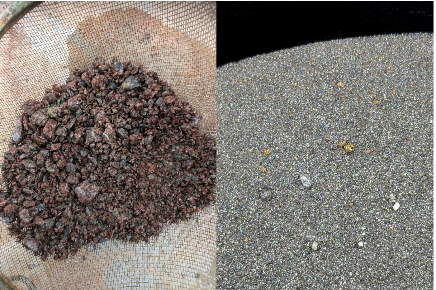
Figure 2. Sieved pink porphyry chips and the pan concentrate from drill hole BRC18020 showing coarse gold (field of view 10cm)

The mineralisation is open at depth as well as along strike to the north. In particular BRC18033 (16m @ 1.81 g/t Au from 32m) was located in an area to the north that was untested and previously thought barren. Additional drilling to improve the structural understanding of the geology is now being planned for the September and December quarters.