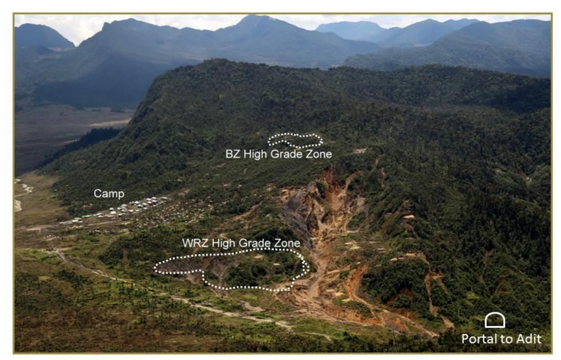
View looking south east over Mt Kare