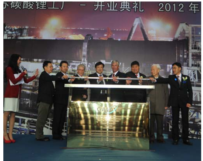
Unveiling of the opening ceremony plaque