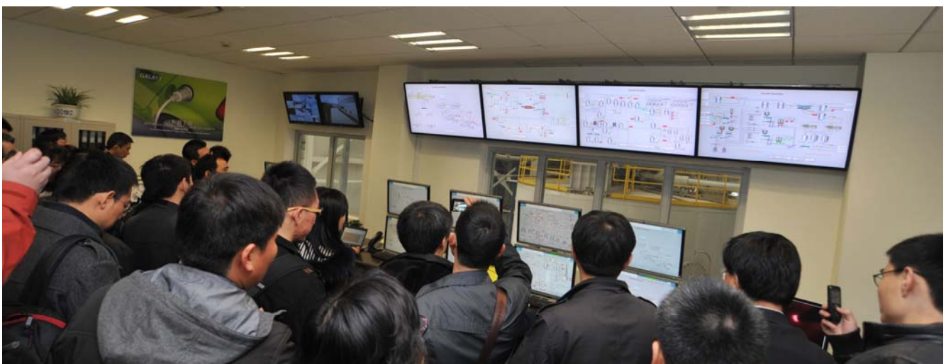
Guests visiting Jiangsu's state of the art control room