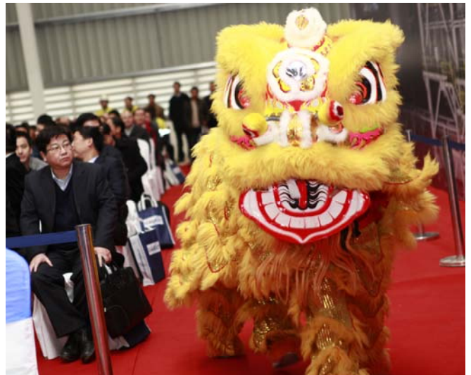
Traditional lion dance to mark the opening of the plant