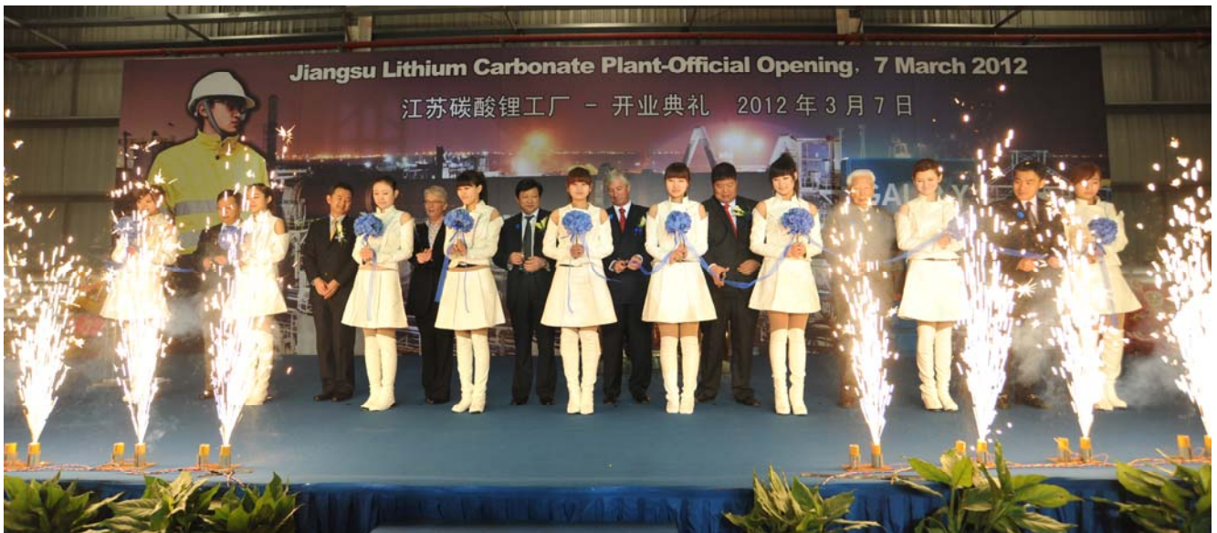
Ribbon cutting marked the official opening of the Jiangsu Lithium Carbonate Plant