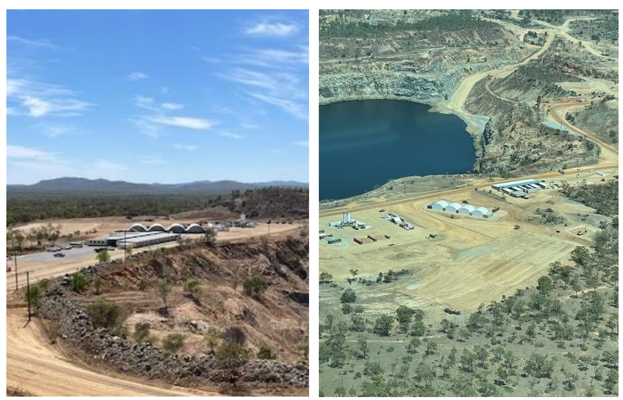
Figure 1: K2-Hydro site establishment works

Overall the construction program continues to track to schedule for first energisation in early CY2024 and completion in Q4 CY2024.