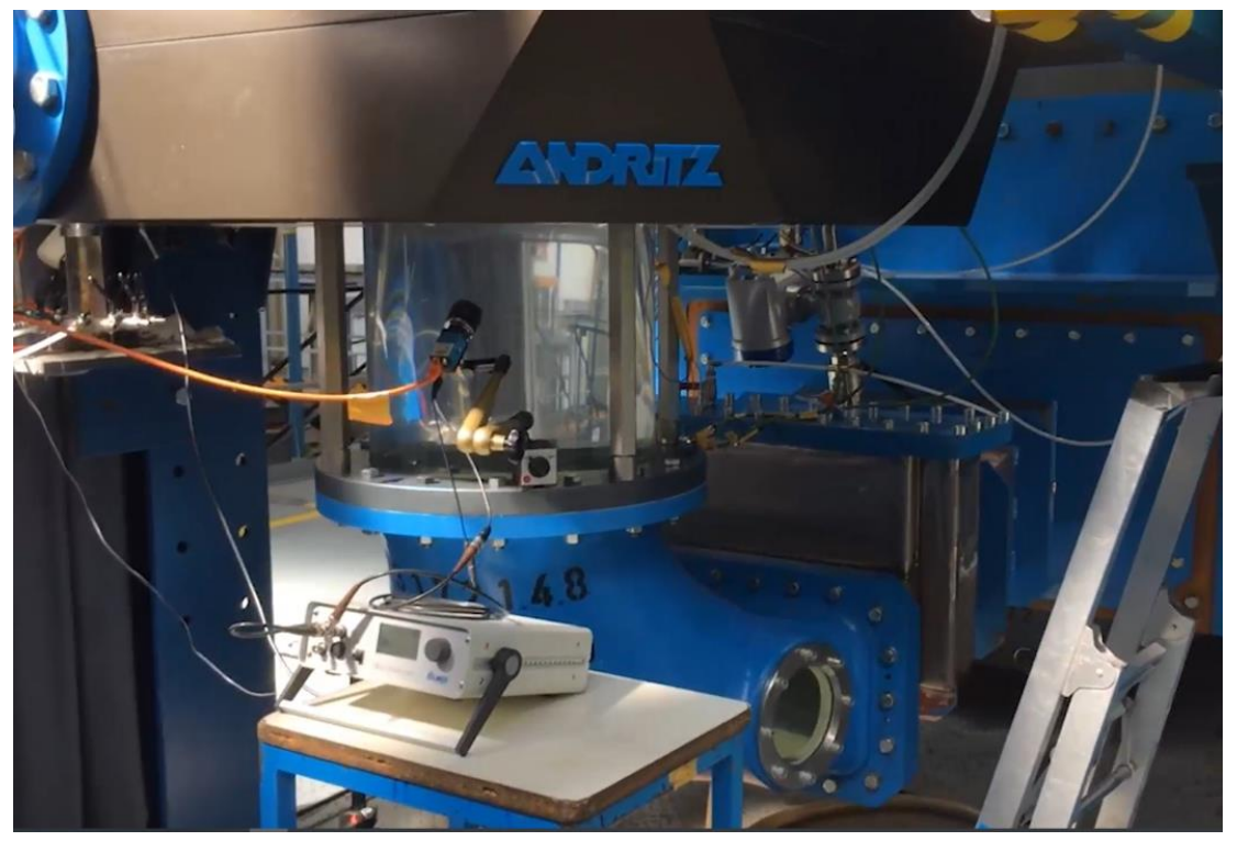
Figure 5: Andritz Hydro Model Testing – Graz, Austria