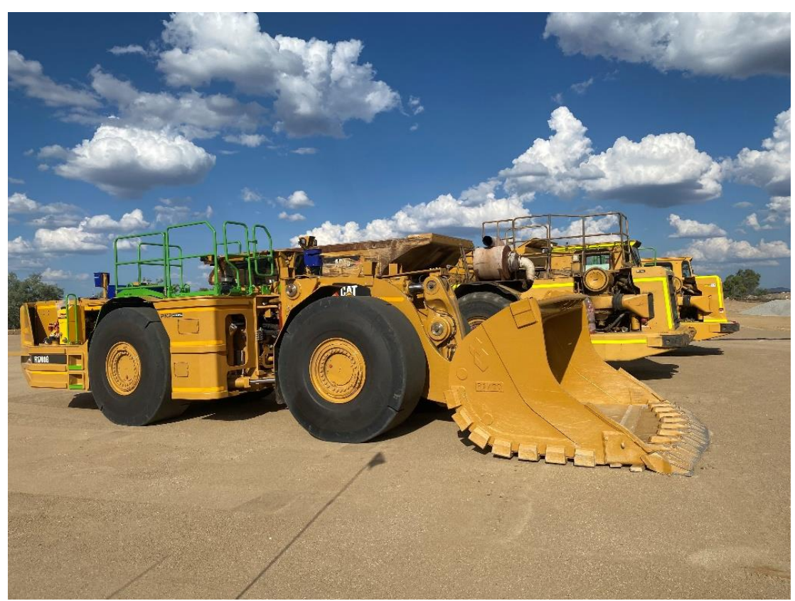
Figure 4: Mobilisation of Tunnelling Equipment