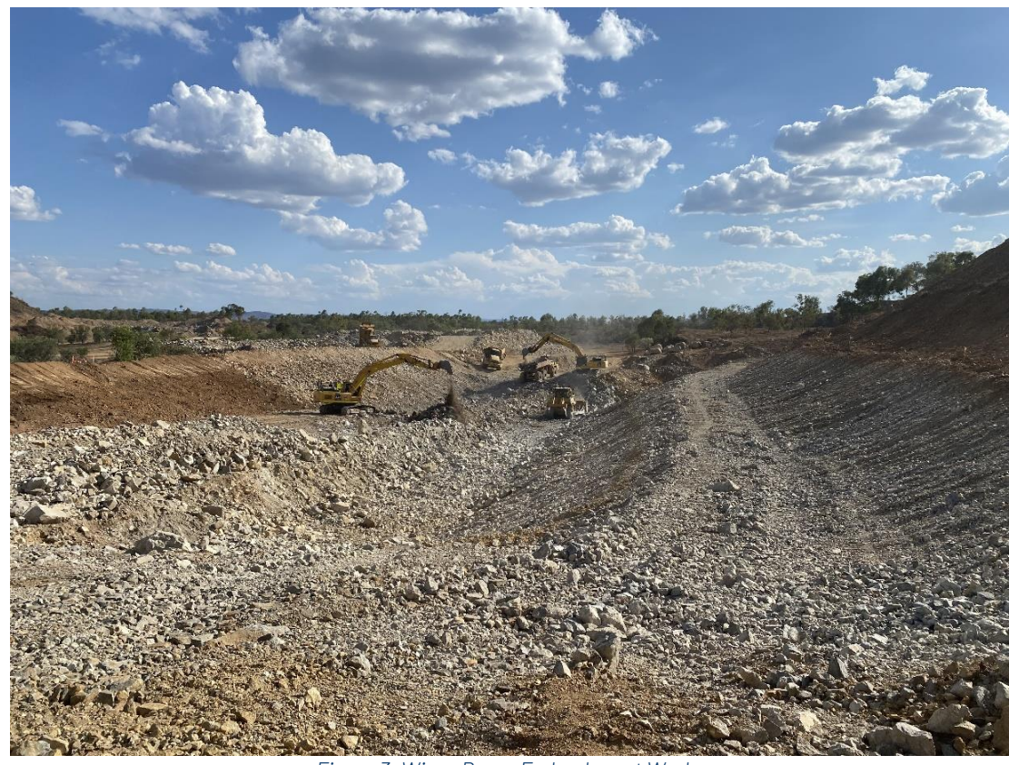
Figure 3: Wises Dam - Embankment Works