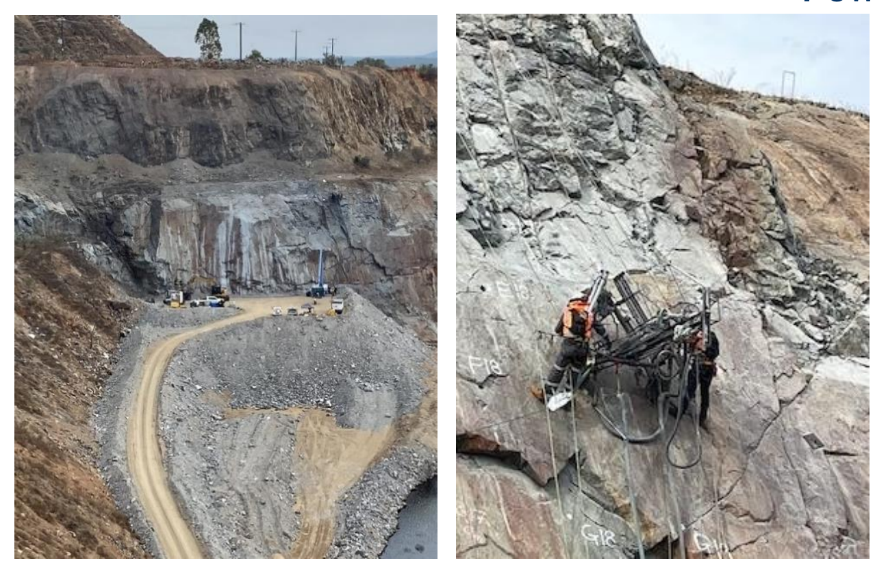
Figure 2: Drilling works ongoing for MAT Face Stabilisation