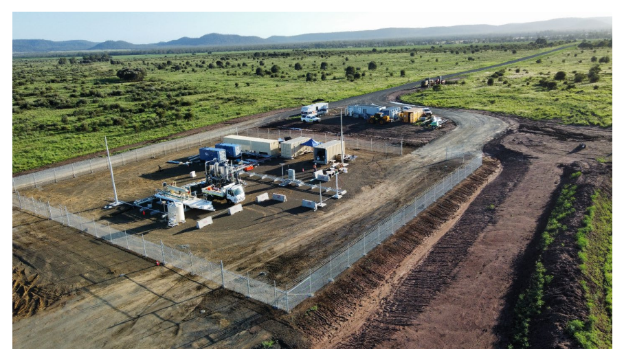
Figure 1: Near completed CNG Facility (15 January 2024)

The work undertaken to weather-proof the access road and CNG facility pad have proven worthwhile with the site remaining in good condition despite continuous rain over the last few weeks. The Company is confident that mechanical completion and plant commissioning can proceed even if wet weather persists. It also means that post commissioning, State Gas will be able to maintain continuous truck access to the facility, which will be critical for continuity of our future gas supply commitments.