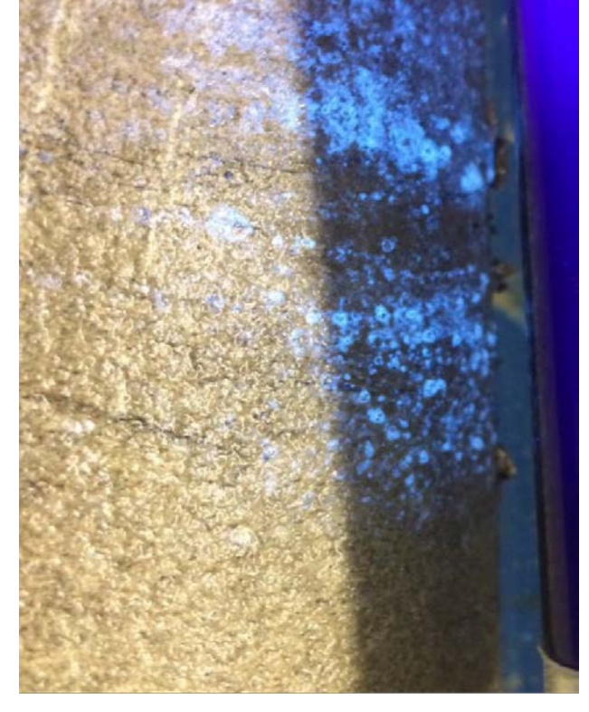
Above : Nyanda-4 core showing coal at 476m, with 40.4m of net coal encountered in Nyanda-4