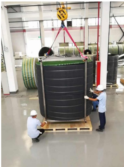
First completed MABR Module

Melbourne, Australia & New York, USA: Fluence Corporation Limited (ASX: FLC) (“Fluence” or the “Company”), a global leader in water and wastewater treatment solutions, today announced that it has successfully produced the first Membrane Aerated Biofilm Reactor (MABR) module in its newly-built production facility in Changzhou, Jiangsu Province, China.