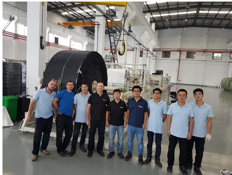
China and Israel engineering and production teams, Changzhou

The spiral production line was developed and tested in Israel with all required machinery and equipment shipped and successfully installed in the Changzhou facility. The plant is now fully operational and ready for the mass production of MABR modules.