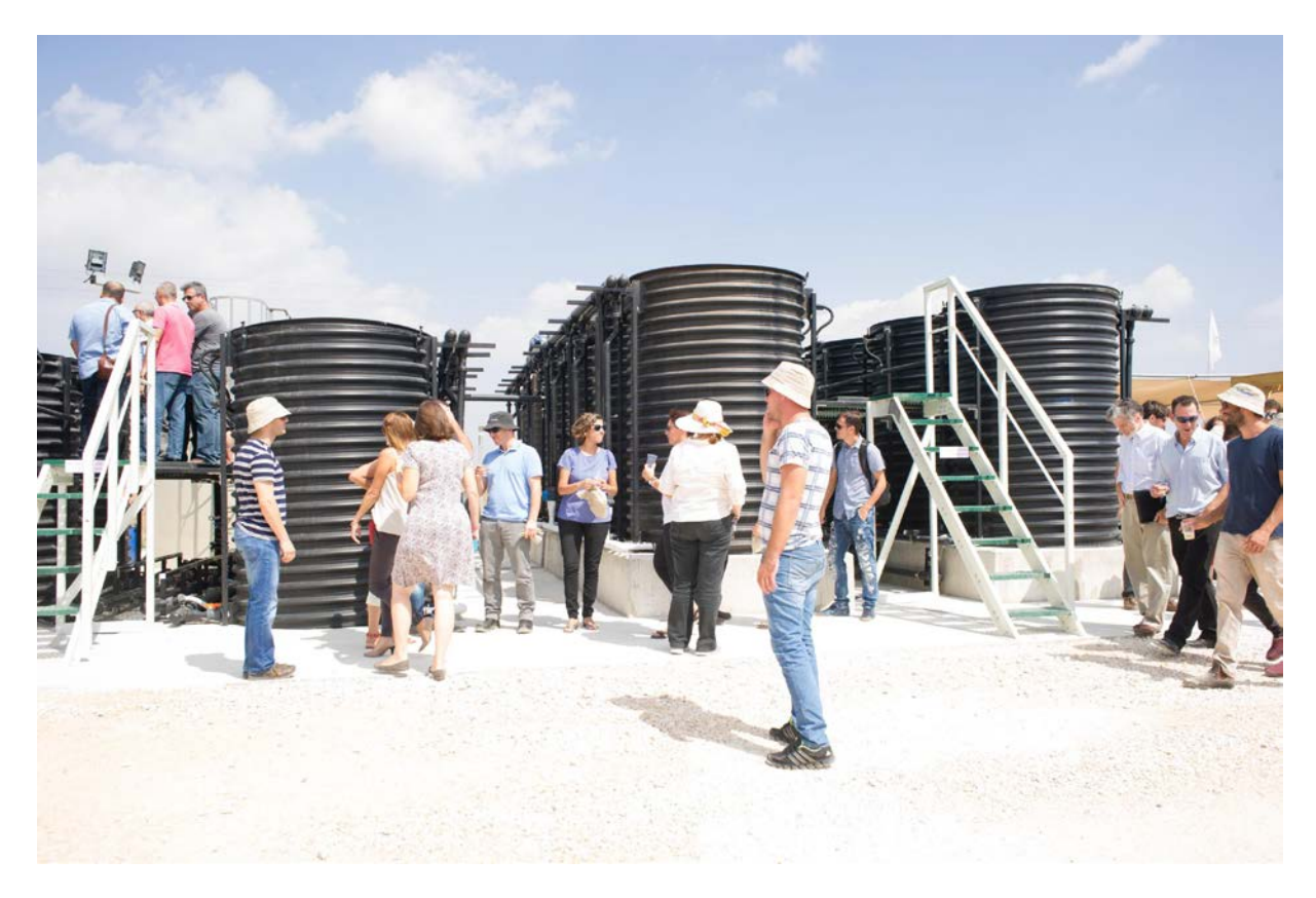
Distinguished guests, Directors, staff, investors and visitors attend the official opening.