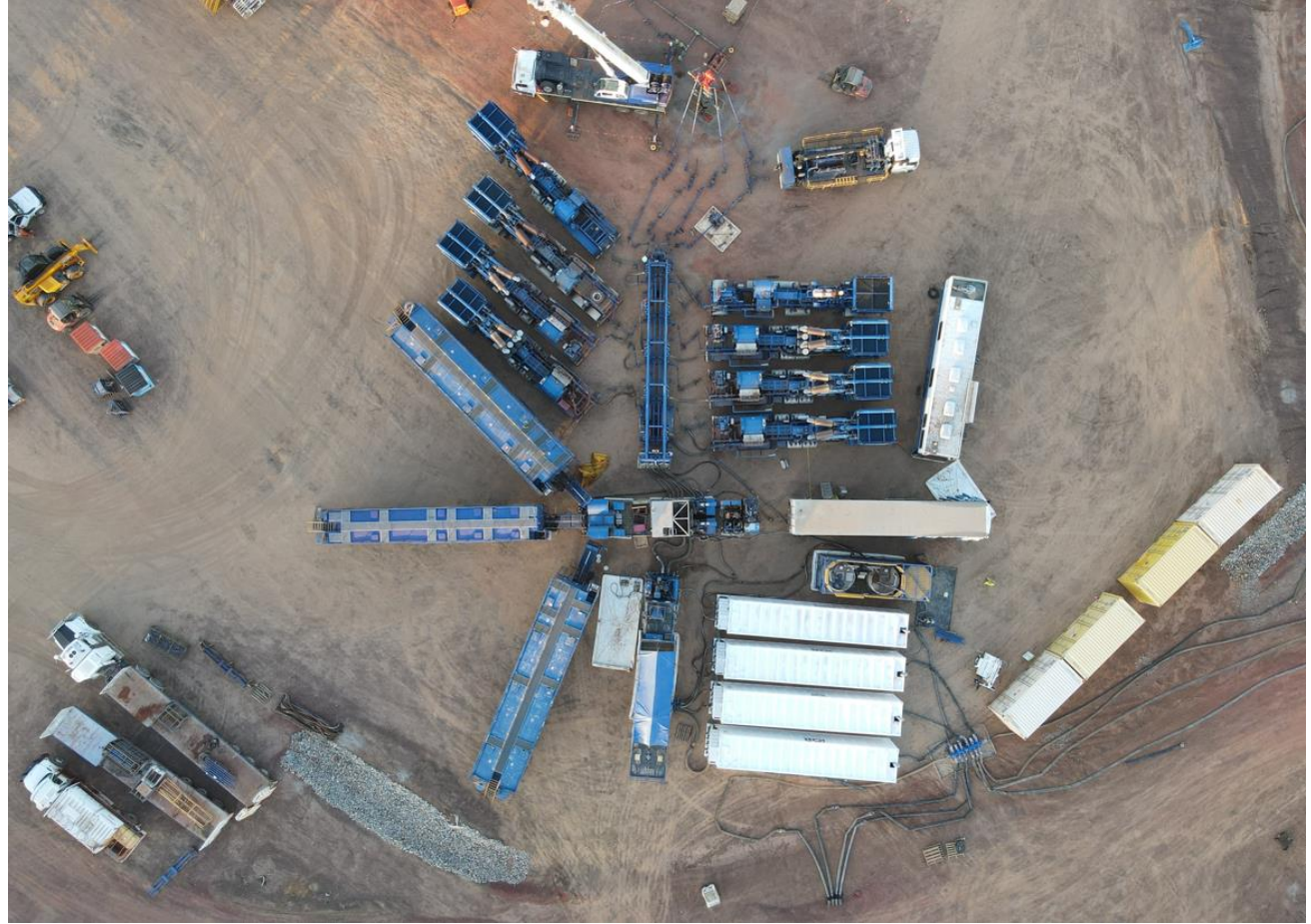
Carpentaria-3H fracture stimulation spread

to both ensure reliable supply and apply downward pressure on price."<sup>15</sup>