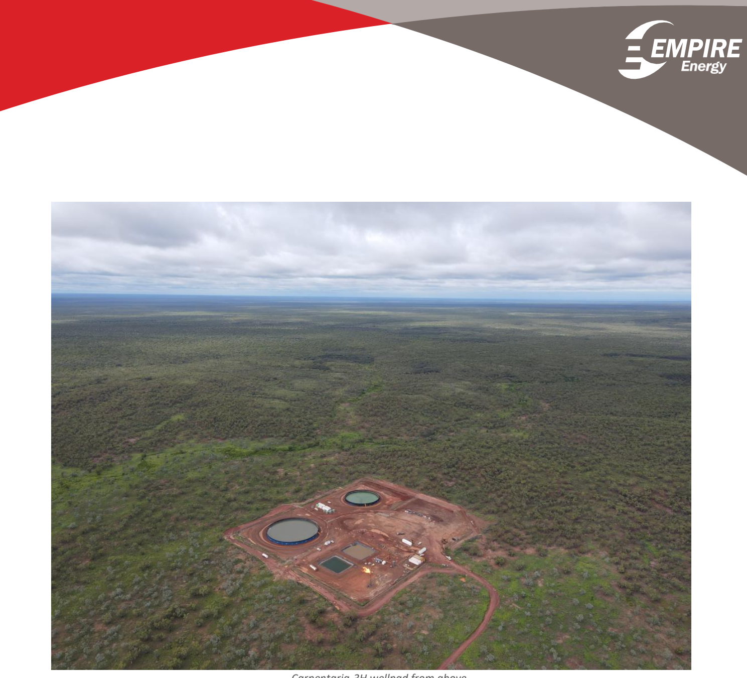
Carpentaria-3H wellpad from above