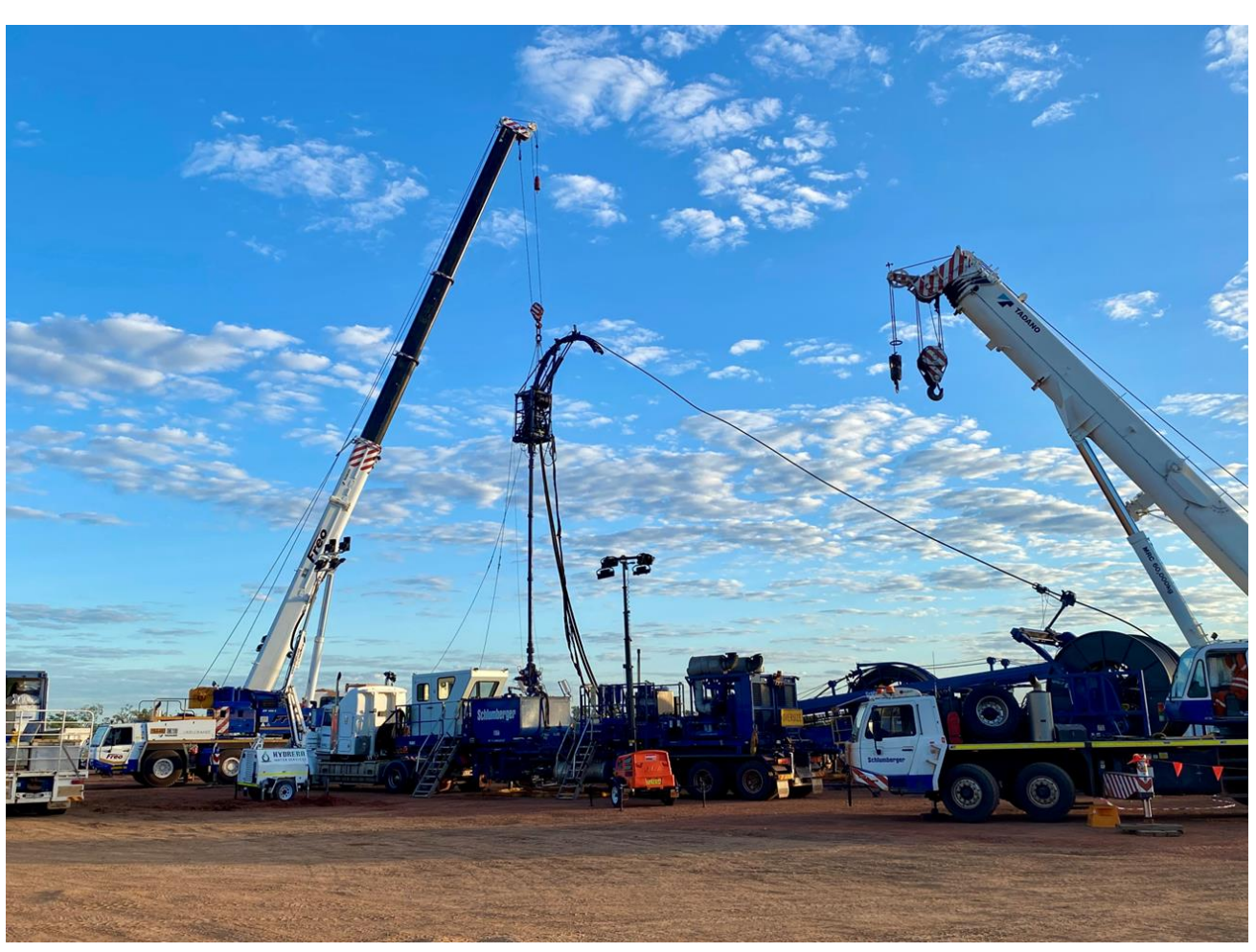
Rig up of the SLB frack spread at Carpentaria-3H

This ASX release has been authorised by the Managing Director