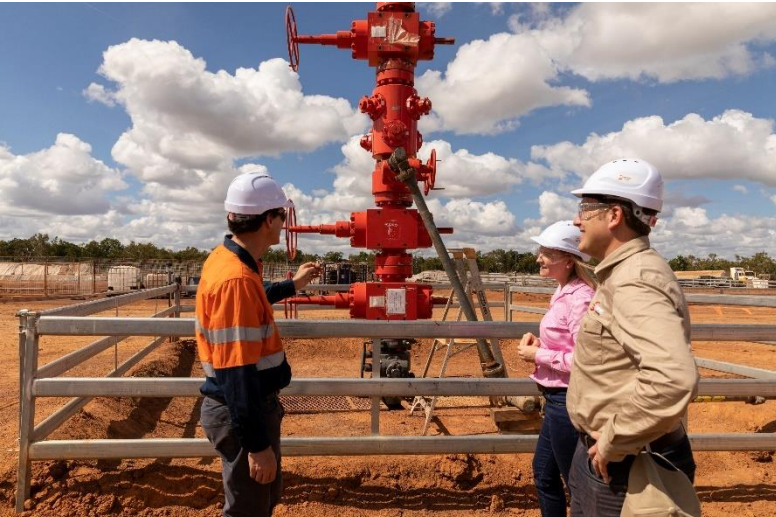
Above: Schlumberger field crew rigging up for Carpentaria-1 hydraulic fracture stimulation