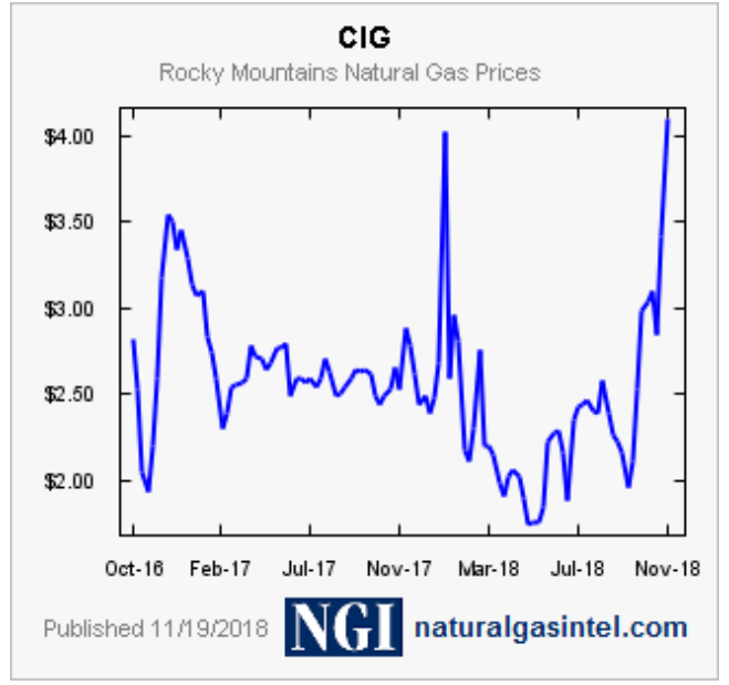
CIG Rockies Price Index

The last two months has seen a sharp rise in the price of natural gas with CIG Rockies benchmark prices currently above US$4/Mcf (AU$5.50/Mcf) (the average CIG Rockies price has been US$2.40/Mcf for the previous 6 months). Gas from the Silvertip Field is delivered into the nearby interstate transportation pipelines and is sold based on the CIG Rockies benchmark price.