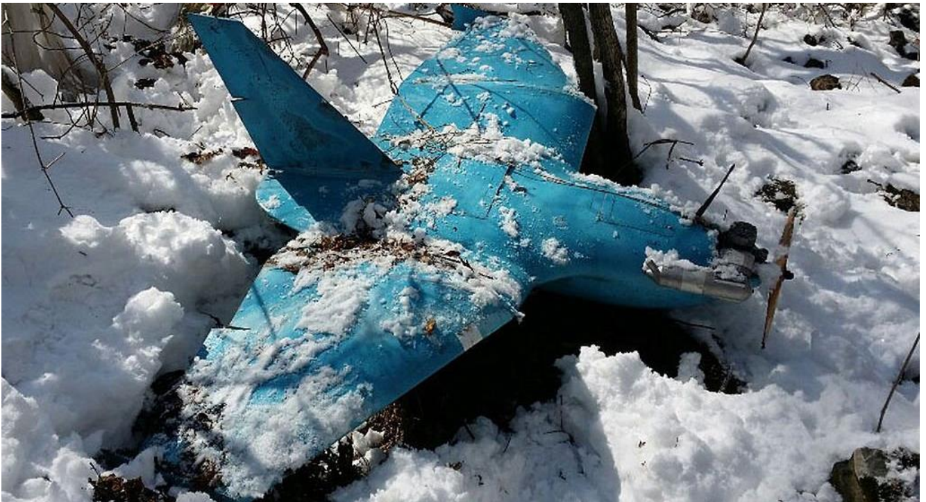
Image: The wreckage of a crashed drone is seen on a mountain on April 6, 2014 in Samcheok, South Korea. Three drones, believed to be North Korean, have been found in South Korea. North Korea is reportedly in possession of about 1,000 drones that can carry a deadly payload, according to a South Korean state-run think-tank.