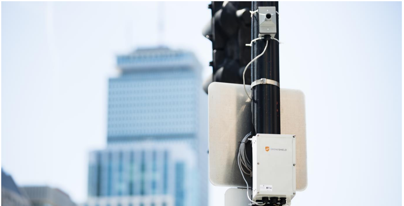
Image: DroneShield deployment at Boston Marathon in 2016