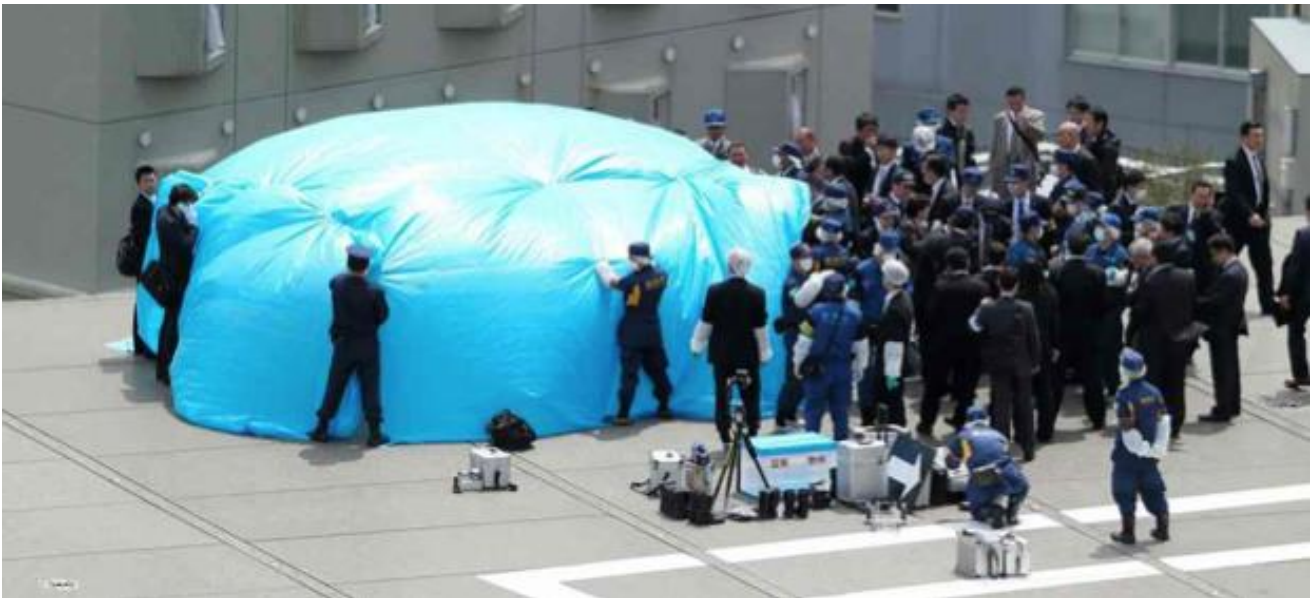
Image: Investigators check a drone, under tarpaulin, on the roof of the Japanese Prime Minister's office in 2015. The camera-equipped drone reportedly landed on the roof of the Japanese Prime Minister's office while containing radioactive material.