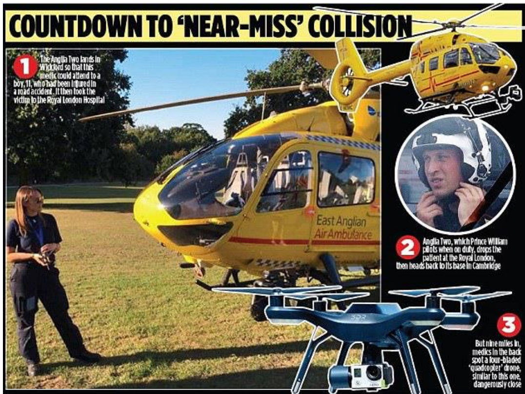
Image: Prince William's air ambulance was reported to have come within half a second of a catastrophic mid-air collision with a remote-controlled drone (March 2017)