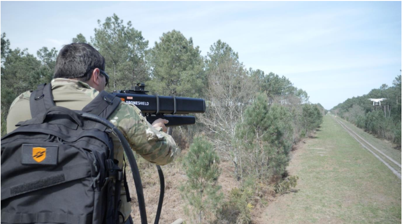
Image: Recent DroneShield demonstration to Special Forces of a European country (April 2017)