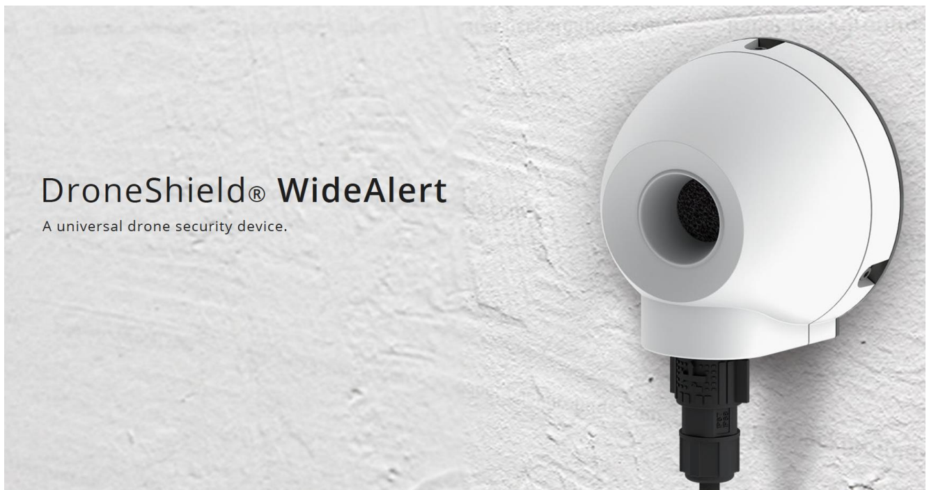
Image: DroneShield WideAlert