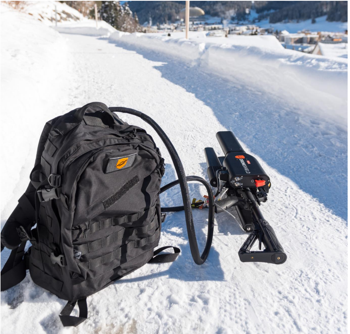
DroneGun, operated by the Swiss police agency Police cantonal Graubünden at Davos, Switzerland, during the January 2017 World Economic Forum