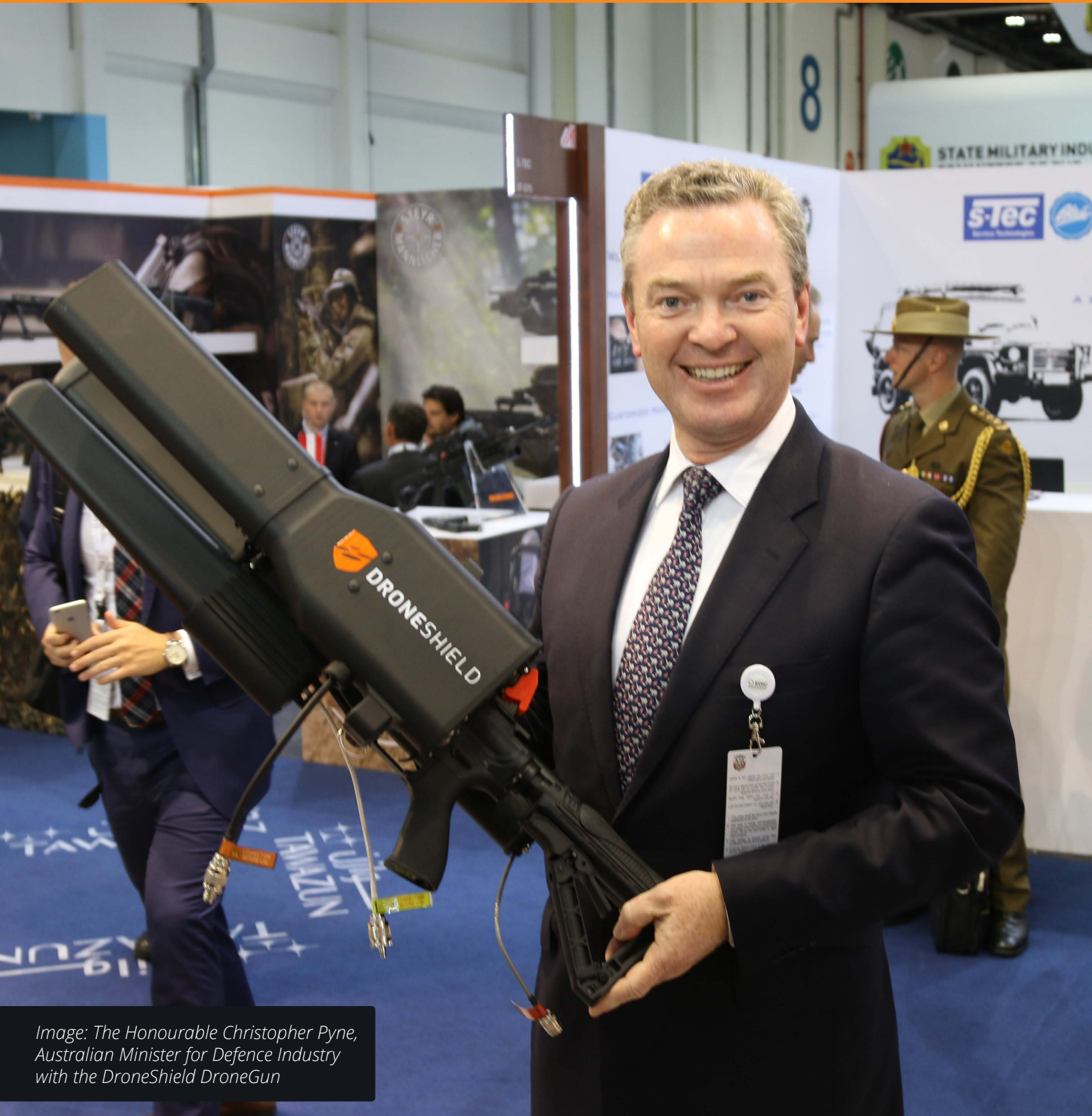
Image: The Honourable Christopher Pyne, Australian Minister for Defence Industry with the DroneShield DroneGun