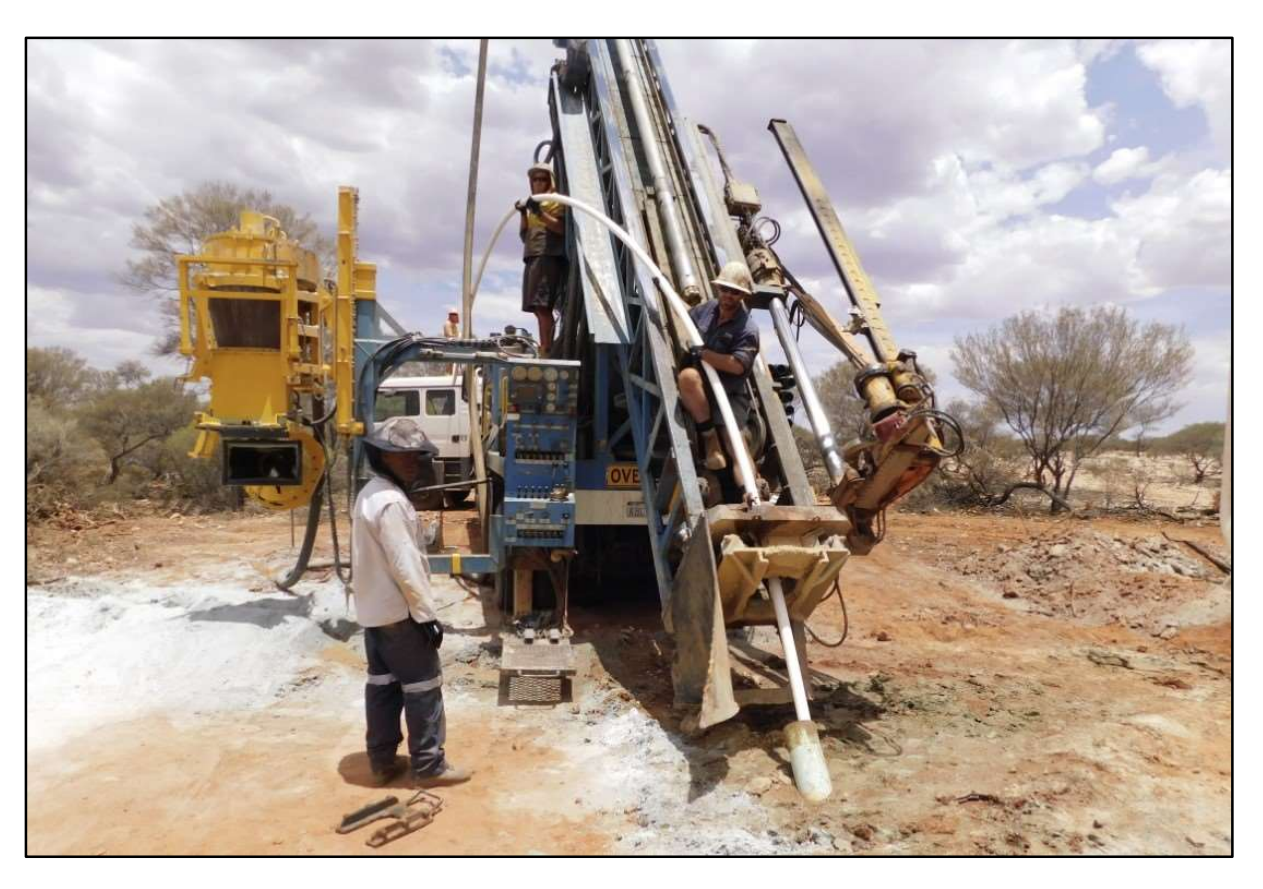
Image 2 - Installing PVC casing in 19ESRC013 for downhole geophysical surveys