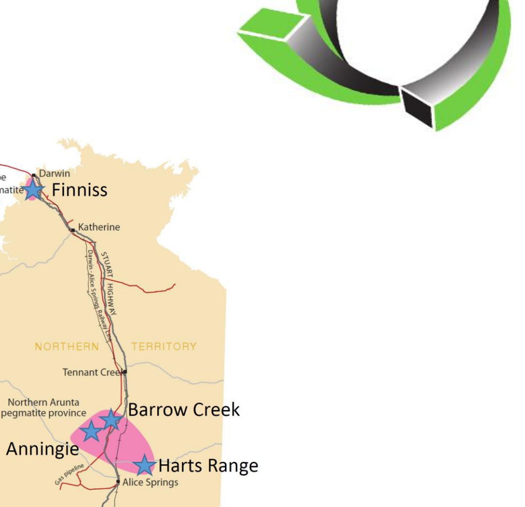
Figure 1. Tin-tantalum pegmatite provinces of the Northern Territory (from NTGS Report 16 – 2004)

As with Greenbushes in WA and Finniss in the Bynoe Pegmatite Field in the NT, the Barrow Creek Pegmatite Field has also had a long history of tin and tantalum mining prior to lithium mineralisation being recognised.