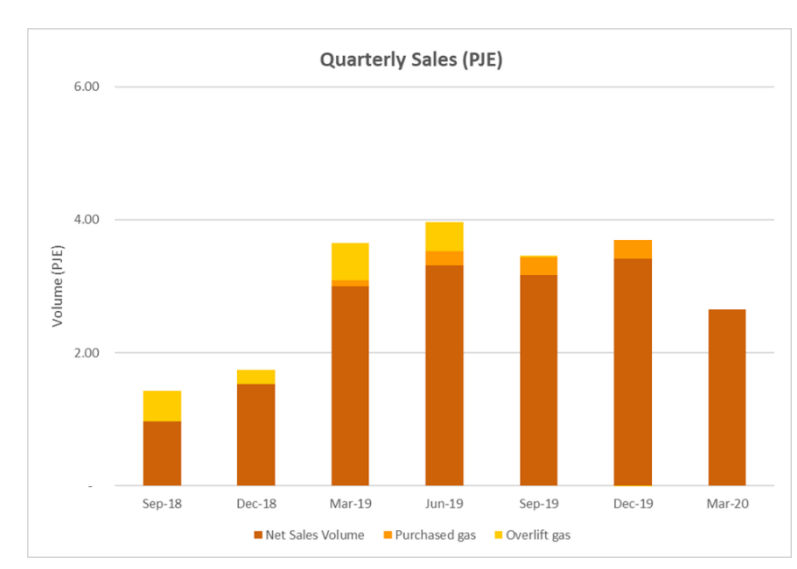
Figure 1: Quarterly sales volumes (CTP equity share)

Sales volumes totalled 2.7 PJE (including 0.45 PJ of overlift repayment gas), down 27% from 3.7 PJE in the December quarter, reflecting historically weak spot gas market conditions for uncontracted production.