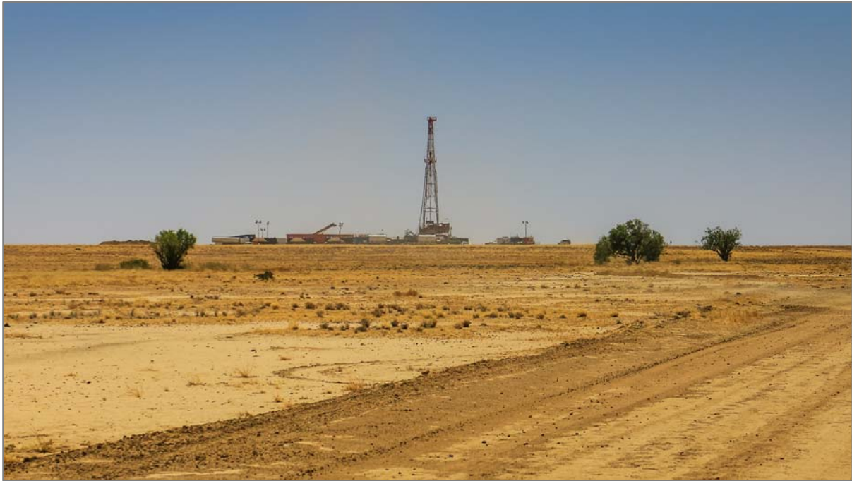
Rig on site at Gaudi-1