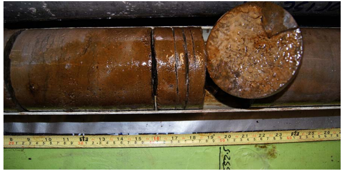
Part of the 9m core cut at Surprise-1 December 2010 (c.2,252-2,253m depth RKB)