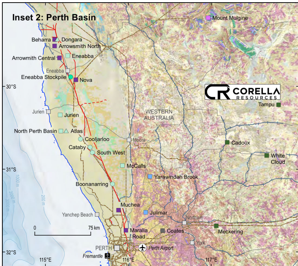
Figure 3 – Inset from Australian Critical Minerals Map 2021 of Perth Basin Region listing Corella's (ASX: CR9) Tampu Kaolin/HPA Project