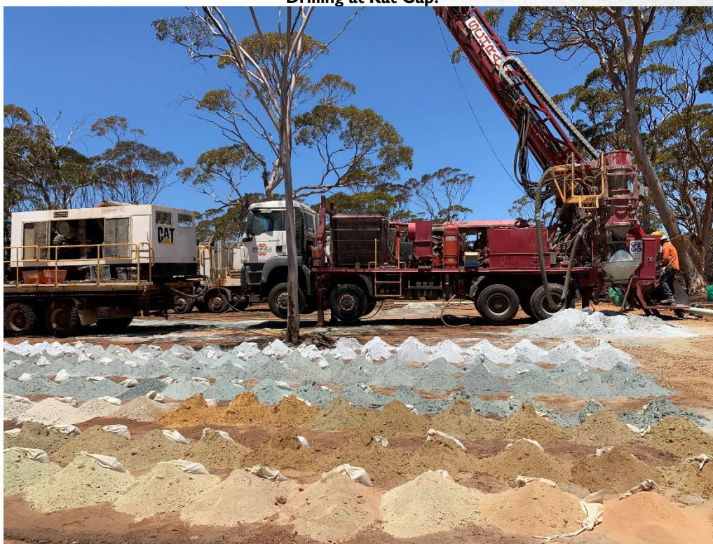
Drilling at Kat Gap: