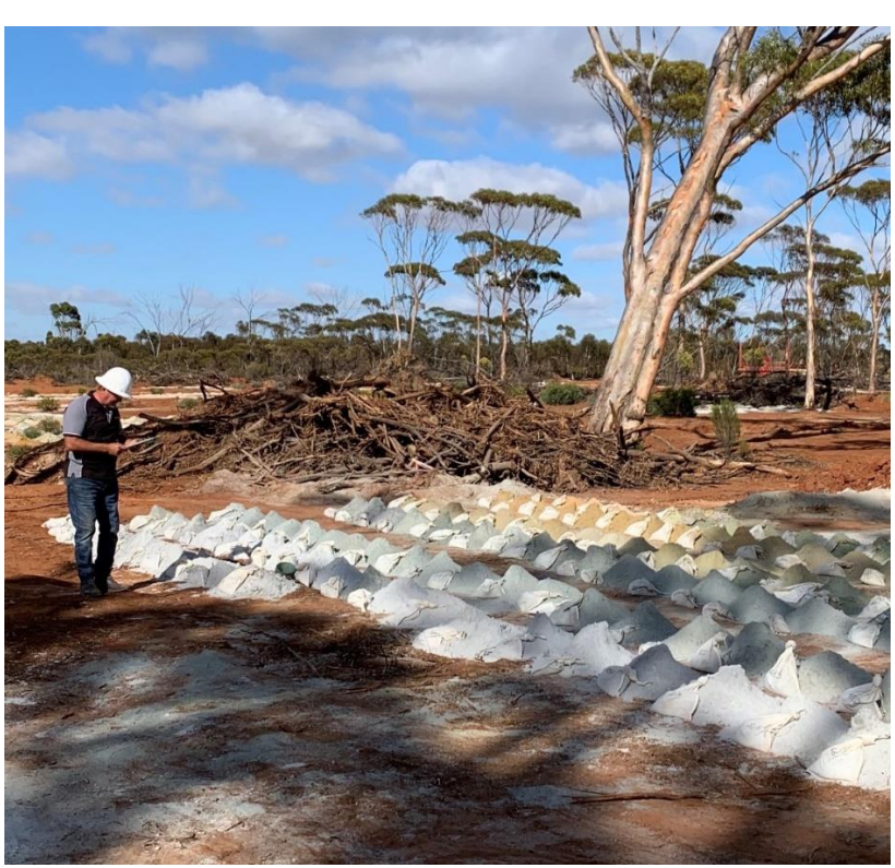
Page 4 of 6