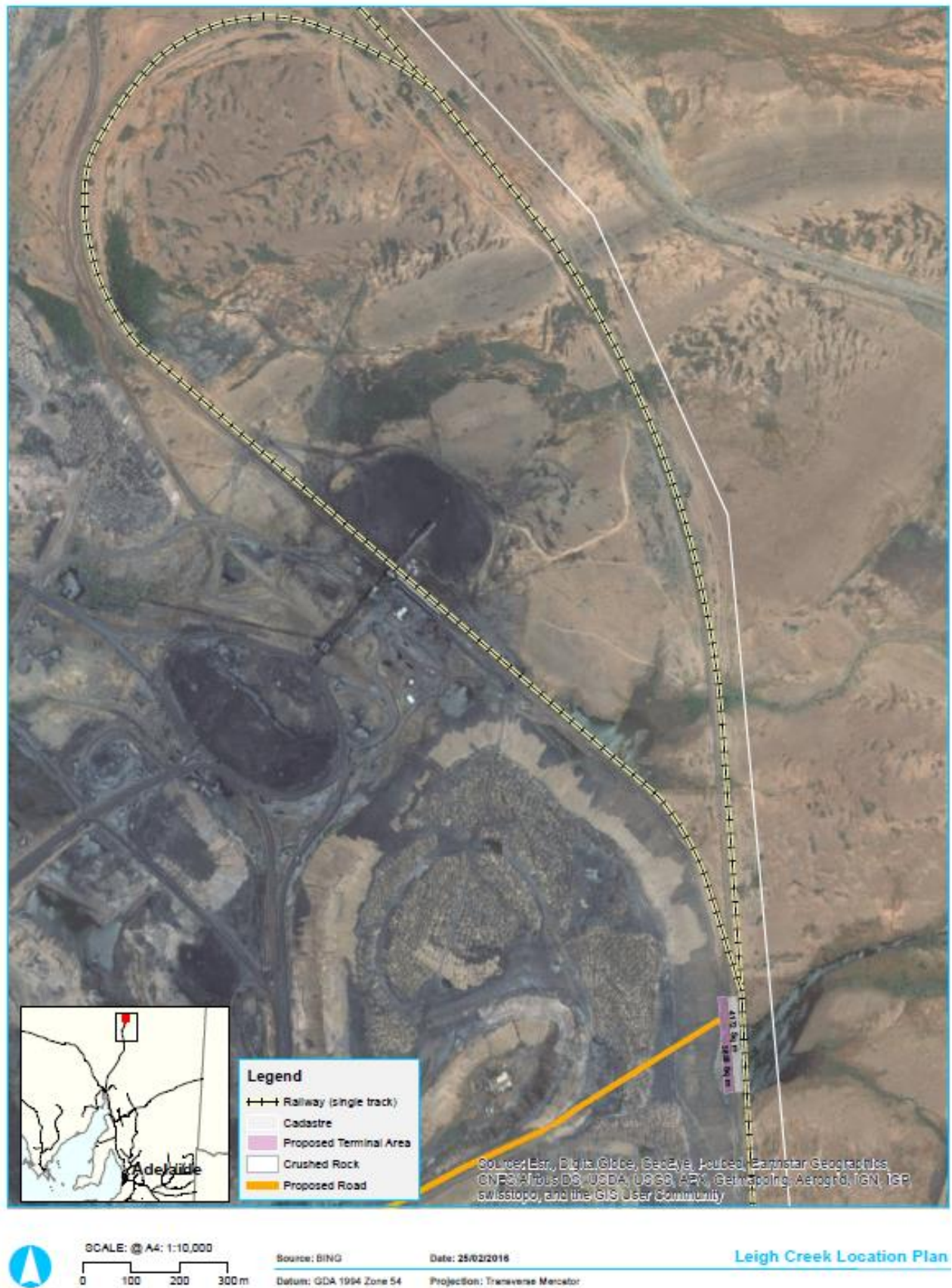
Figure 1: Preferred location of shared infrastructure facility