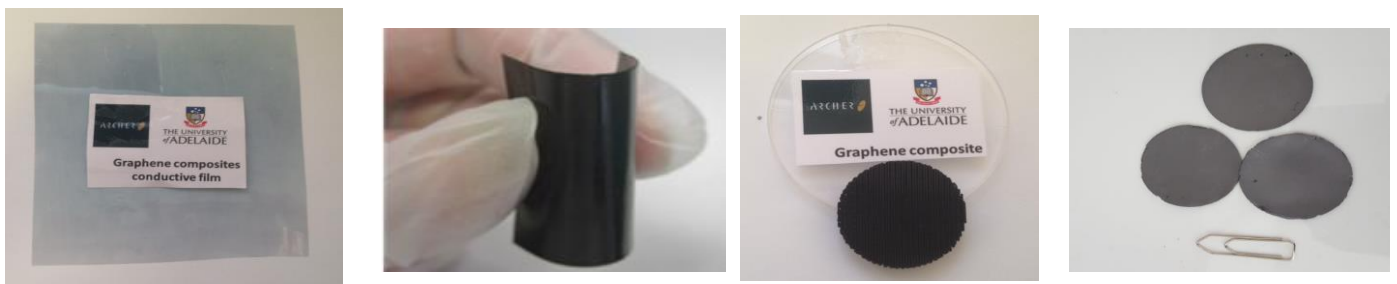
Figure 2. Selected graphene products produced from Archer graphite (graphene conductive film, conductive flexible polymer, graphene composite and electrodes for battery and supercapacitor applications)

Several products including conductive ink, graphene conductive coating, and graphene electrodes were prepared.