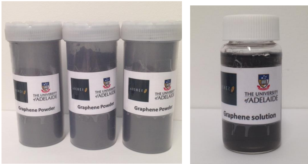
Figure 1. Graphene powder and graphene water dispersion prepared from Archer graphite