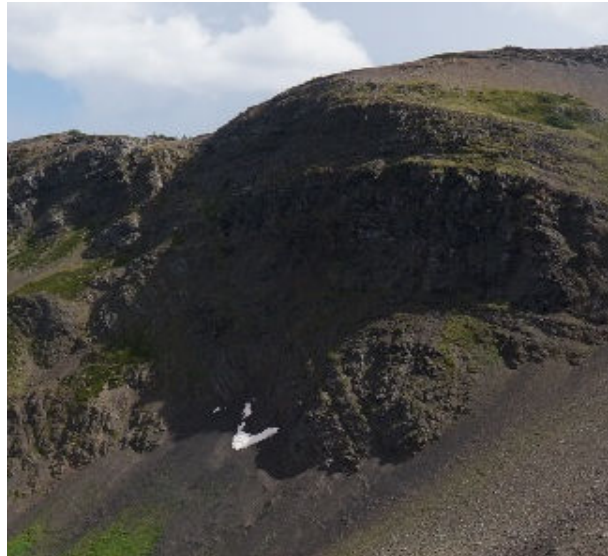
Anthracite seam exposures at Panorama

The Company has received approval for its Notice of Work (NoW) at Panorama following local community and First Nations consultation. The approval of the NoW will allow the Company to undertake drilling, trenching and sampling which is scheduled to commence in 2015, with 9 drill site locations already identified.