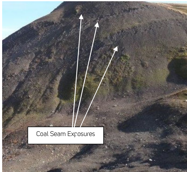
Anthracite seam exposures at Panorama