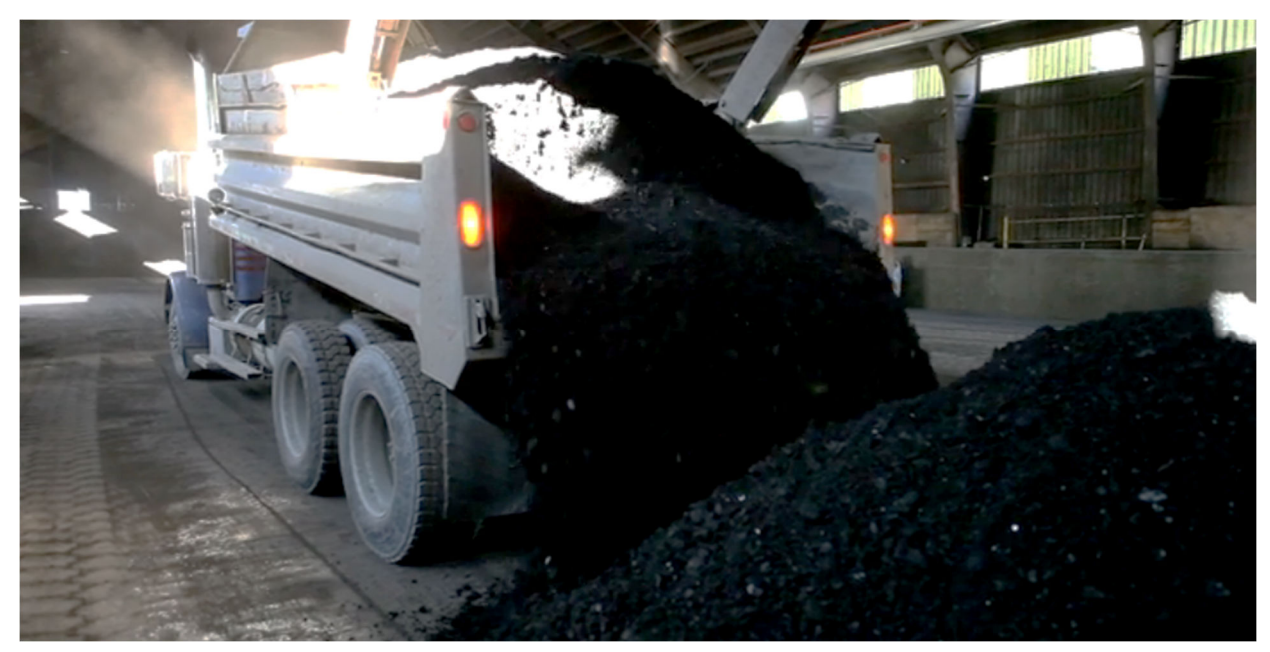
Testing the SBT unloading and storage facilities

The Company recently transported high grade anthracite to the Stewart Bulk Terminals ( SBT ) at the Port of Stewart for testing of storage, coal handling and loading facilities.