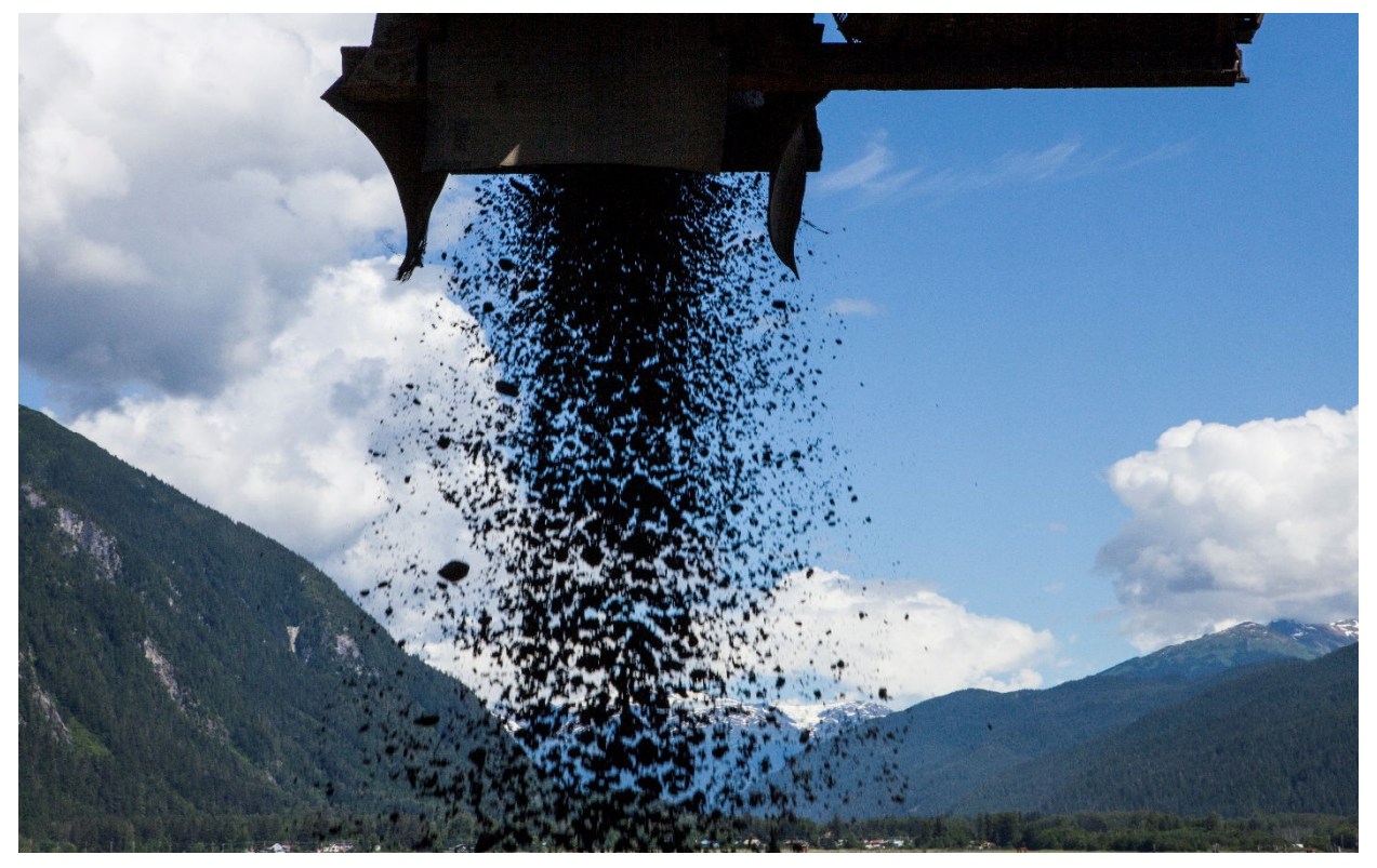
Testing of loading hoppers