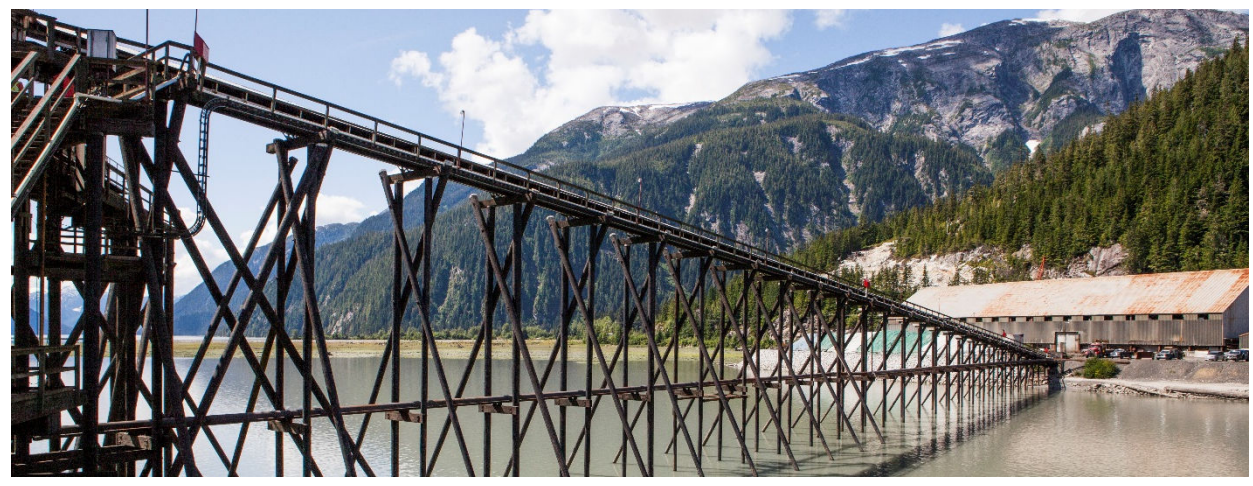
Stewart Bulk Terminal at the Port of Stewart

"It has been two short years since Atrum was publicly listed and we are excited to report a successful trial of the ship-loader at the Stewart Bulk Terminal in the Port of Stewart. As the project starts to gather pace, this is a significant milestone in proving our logistics chain and we are looking forward to completing customer sample loads later this year."