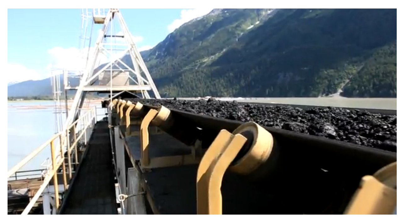
Testing the ship-loader conveyor

High grade and ultra-high grade anthracite from the Company's Groundhog North operation has been stockpiled at SBT. Recent testing at the port showed that the existing equipment is capable of loading at least 1.5Mtpa of high grade and ultra-high grade anthracite. The Company also has an MOU in place for a further 5Mtpa at Stewart World Port (SWP) which is currently under construction.