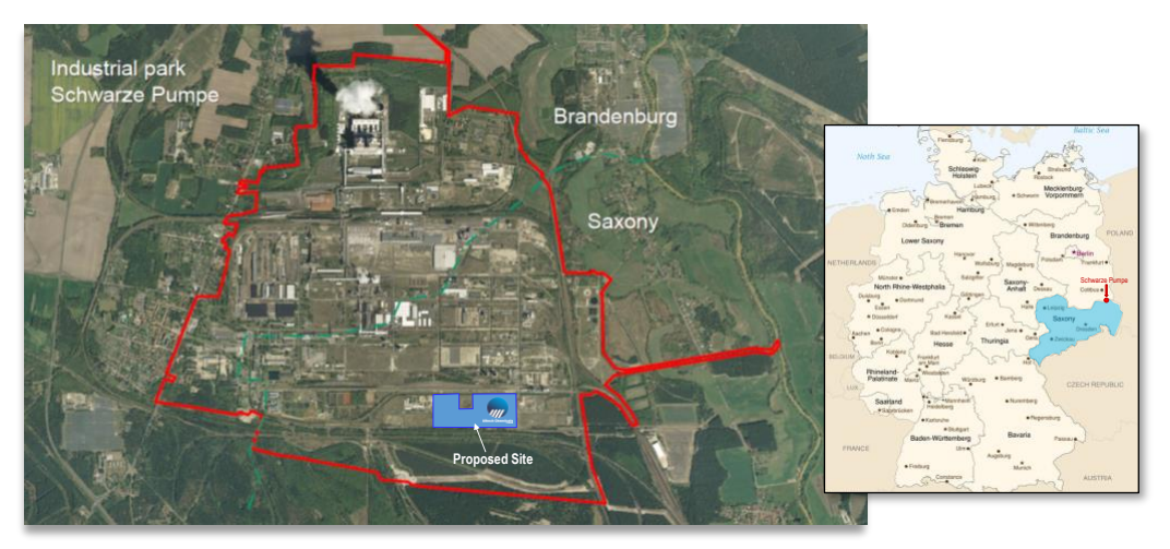
Figure 1: Location of the Schwarze Pumpe Industrial Park and the ~10Ha industrial site available to Altech

The agreement provides Altech with an initial 12-month term during which it can exercise its purchase option, with the ability to extend the option period by a further 12-months via mutual consent. The purchase price for the site is confidential, however on a per-hectare basis the price is considerably less than comparable brownfields industrial sites in Malaysia or Western Australia. During the option period Altech will have access to the site for planning and assessment purposes. Altech is investigating the site as a preferred location for a second HPA plant, specifically to service forecast demand for HPA from Europe's burgeoning electric vehicle and renewable energy battery sectors.