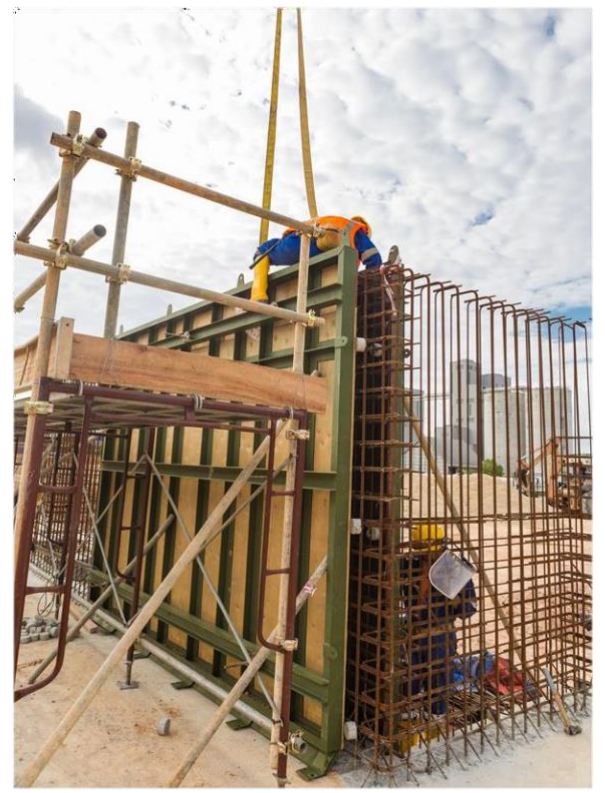
Steel work for concrete retaining wall