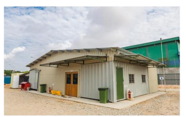
Contractor site office