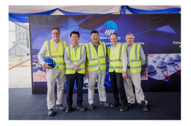
Board and investor delegates