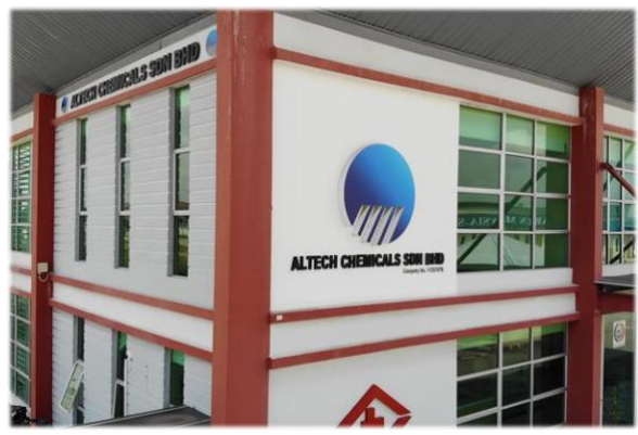
Altech Johor office, 300m from site