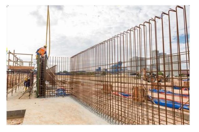
Administration building retaining wall