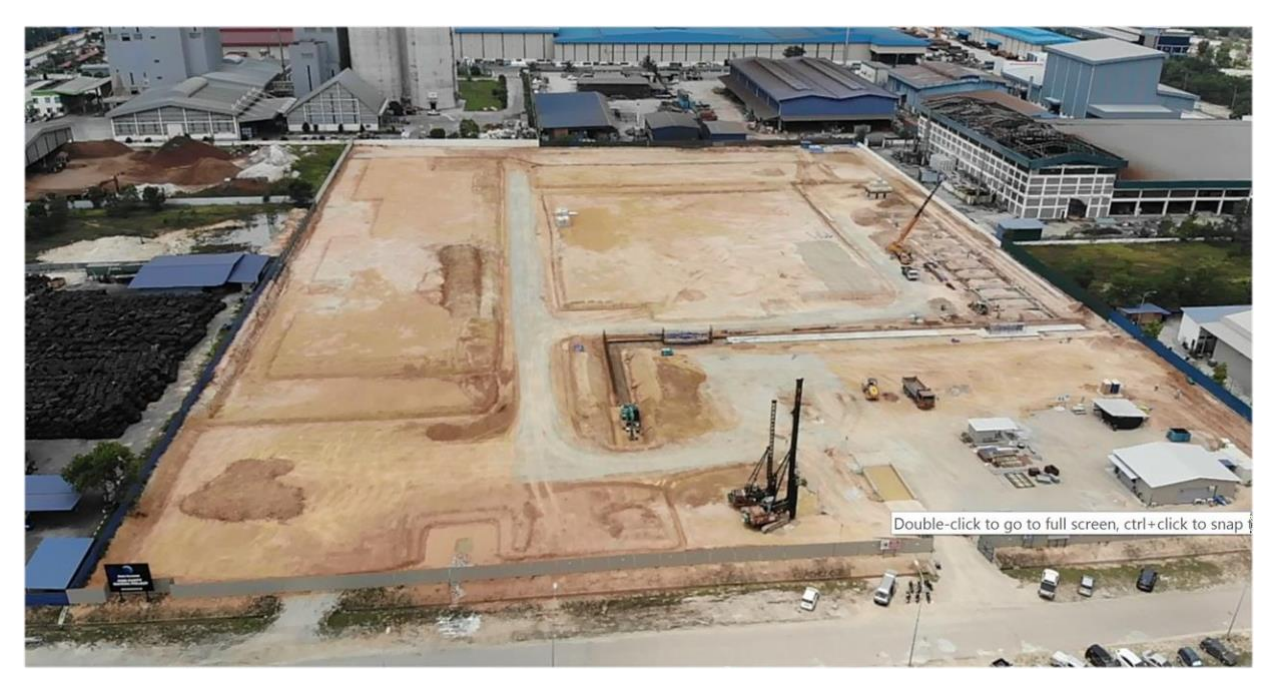
Aerial view showing progress of Stage 1 construction