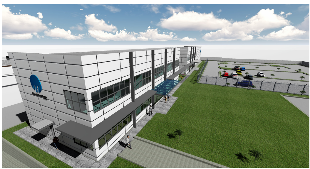
Figure 3 – Administration and Process Building

Telephone: +61 8 6168 1555 Facsimile: +61 8 6168 1551 Website: www.altechchemicals.com