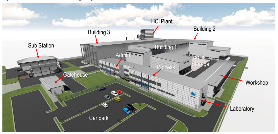
Figure 1 - HPA Plant Final Buildings Layout