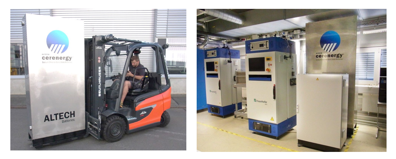
Figure 4 – Completed first stainless-steel casing delivered to Fraunhofer Testing Centre

Whilst the cells are being fabricated, the first stainless-steel vacuum-sealed battery case has been delivered to the Fraunhofer Institute in Dresden. Prior to assembly of the battery cells, the battery casing will undergo comprehensive heat transfer loss testing as well as temperature profiling by the Fraunhofer scientists. The cells will be assembled in the pack once they are completed and further cycling and long-term performance tests will be conducted on the battery packs.