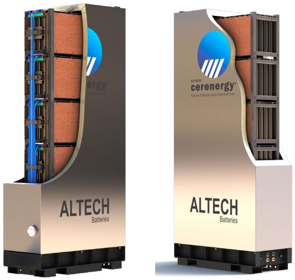
Figure 2 – Cross section of 60 KWh ABS60 showing vacuum-sealed pack and cell frames

Further enhancements have been made to the five internal frames each housing 48 cells, optimising their performance. The connector plates, responsible for electrically linking the cells while maintaining insulation (using mica insulation), have been meticulously designed by the Altech team. The cells are connected through precise laser-targeted welding. Figure 2 shows the cross-section of the pack casing and assembly frames holding 48 cells in each frame.