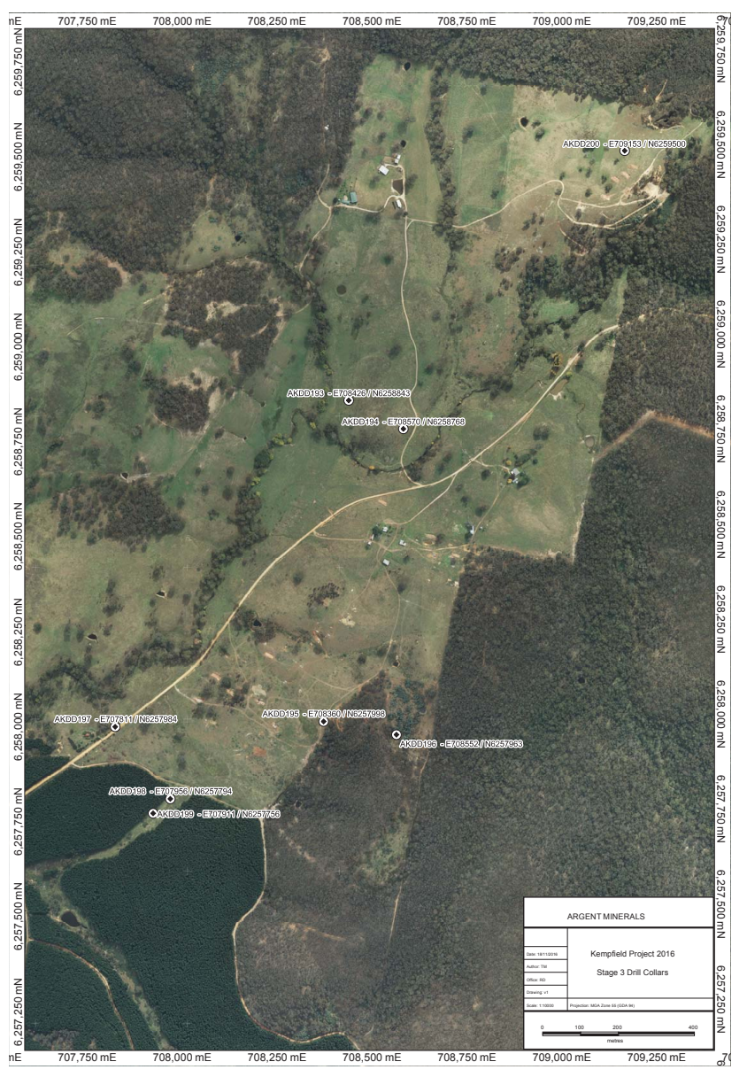
Figure 1 – Plan view of the Kempfield drillhole collar locations.

The Kempfield drilling program follows up the findings of the exploration results announced on 10 October 2016. Figure 1 is a plan view of the drillhole collar locations on an aerial photograph of the Kempfield site.