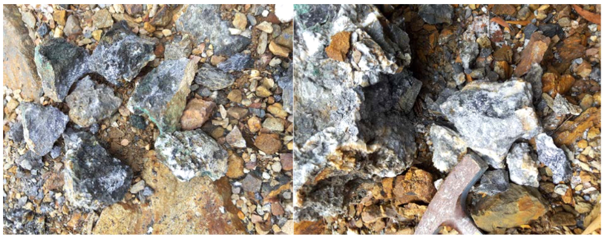
Figure 2 – Photos of rock chip samples ARDQ03 (LHS) and ARDQ04 (RHS) showing massive galena and minor chalcopyrite hosted by carbonate and shale

The potential deposit types in the Queensberry area range from Volcanic Hosted Massive Sulphide deposits, Intrusion Related Skarn, Vein Oxides, and Base Metals.