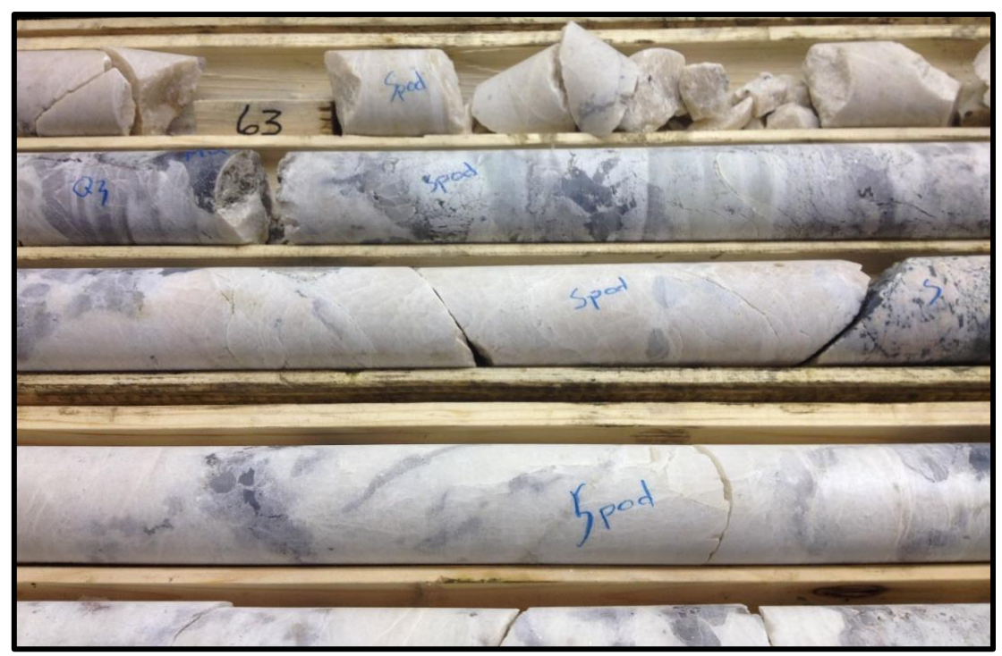
Figure 1. Drill core obtained from hole SL-16-73 showing a portion of the 15m intersection of high quality spodumene-bearing pegmatite.

Ardiden confirms that 85 assay results of the 310 drill core samples from the program have now been received from Actlabs laboratory in Thunder Bay. The assay results, from drill holes SL-16-47 to SL-16-54, have confirmed the presence of substantial lithium mineralisation at various grades in all 85 samples, with significant assay grades of up to 4.69% Li<sub>2</sub>O (SL-16-54) identified.