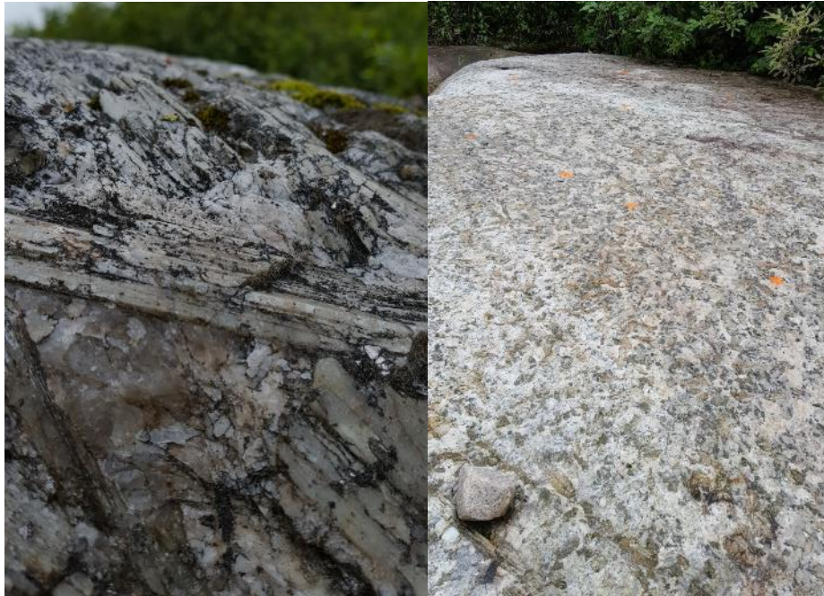
Figure 1: North Aubry – close-up of spodumene crystal horizontal at surface (left); Prolific showing of spodumene crystals which have formed horizontally and vertically in the pegmatite (right)

The channel samples will help Ardiden to identify the most prospective zones and allow definitive target generation within the pegmatite structures, while also providing data for planned drilling program and future resource definition.