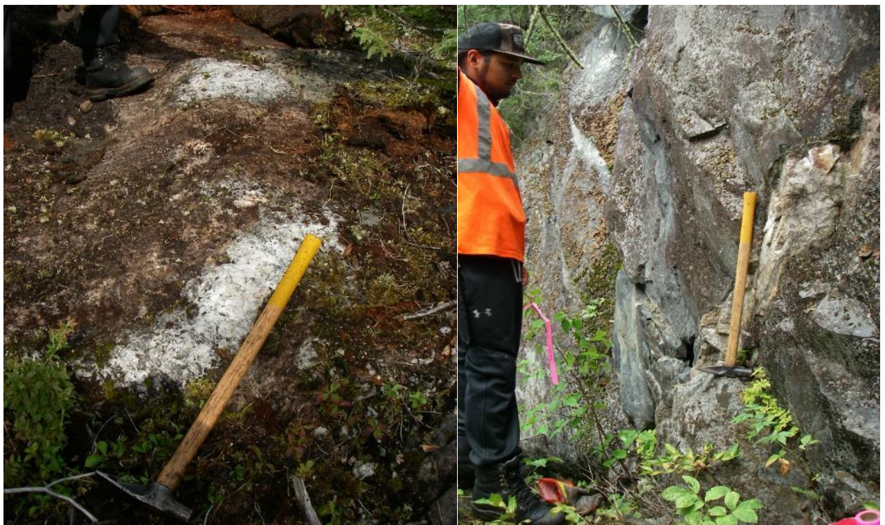
Figure 4. Examples of additional pegmatite occurrences identify at Seymour Lake lithium project

Once the geological team has completed the first pass of the detailed exploration across the project, Ardiden will test some of the initial interpretations with planned confirmatory excavations programs, with the aim of exposing the pegmatite mineralisation extensions in areas of shallow alluvium cover.