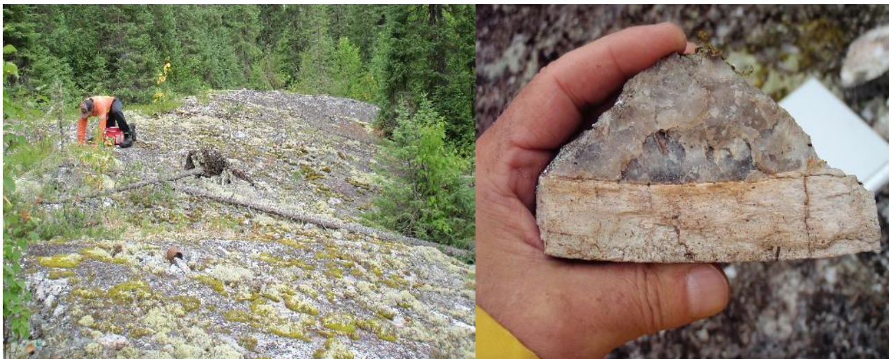
Figure 3. Exposure of the Pye pegmatite (Left). Example of spodumene from the Pye prospect (Right).

Sampling and mapping at these prospects are continuing, and once the samples have been prepared and logged, they will be submitted to the Actlabs Laboratory for analysis.