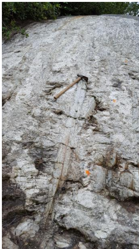
Figure 2. North Aubry – example of extremely long spodumene crystals