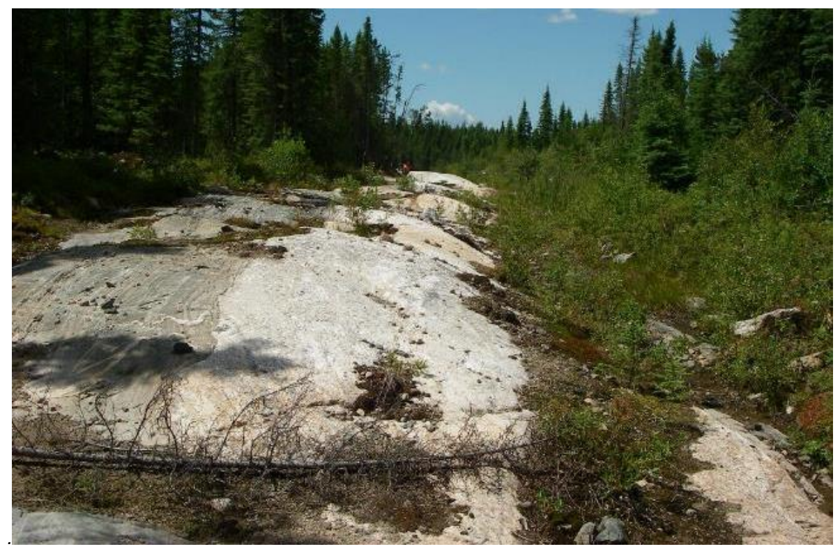
Figure 4. Visible spodumene mineralisation in the extensive outcropping of the Root Lake Pegmatite.