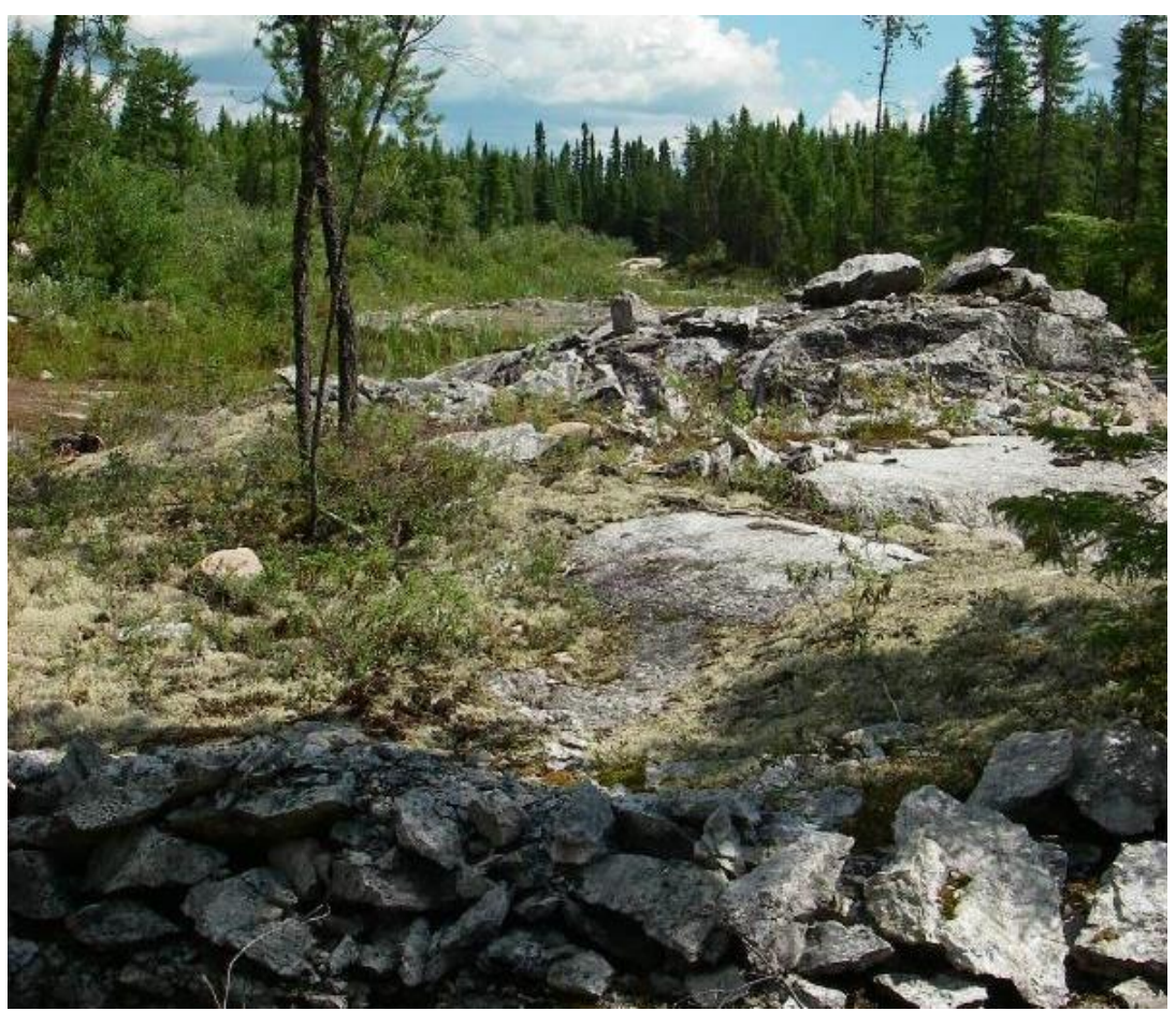
Figure 5. Further visible spodumene mineralisation at the outcropping Root Lake Pegmatite.