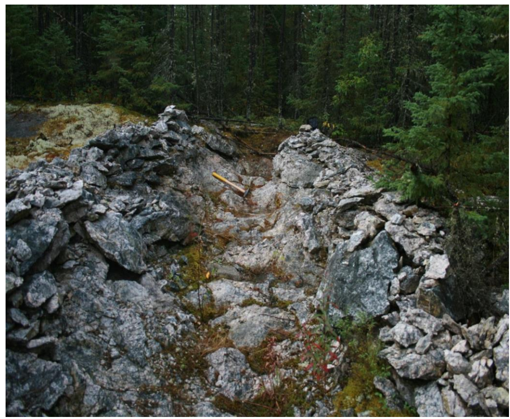
Figure 2. 1955 Historical Trench Sampling of the Pegmatite at Root Lake

In 2009/2010, Golden Dory completed a trenching and sampling program on the outcropping zones of the pegmatite structure, which is located approximately 75m to 100m north of the historical drilling locations. Golden Dory reported grades of up 4.43% Li<sub>2</sub>O from those trench samples.