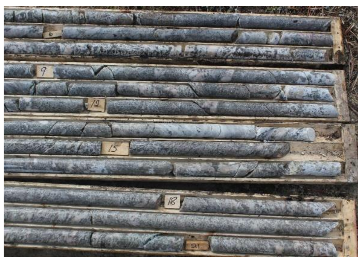
Figure 3. Drill core from the McCombe Pegmatite at the Root Lake Project showing multiple intersections of spodumene mineralisation.

The limited due diligence drilling previously completed by Ardiden confirmed multiple mineralization zones at the McCombe prospect.