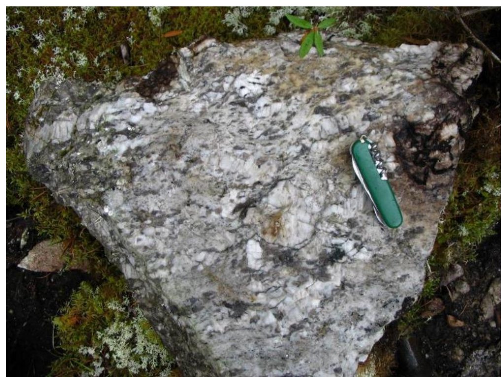
Figure 4. Outcropping Pegmatite identified in 2005 at Root Lake.

The upcoming drilling is a key component of the Company's due diligence review of the project.