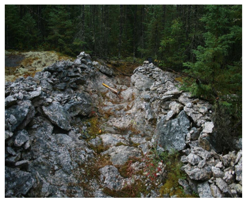
Figure 3. 1955 Historical Trench Sampling of the Pegmatite at Root Lake