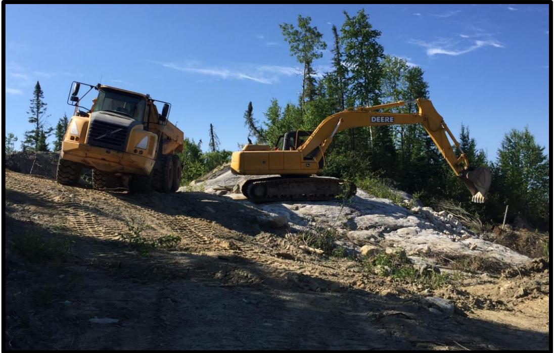
Figure 2. Excavator and truck collecting the bulk sample from North Aubry prospect.