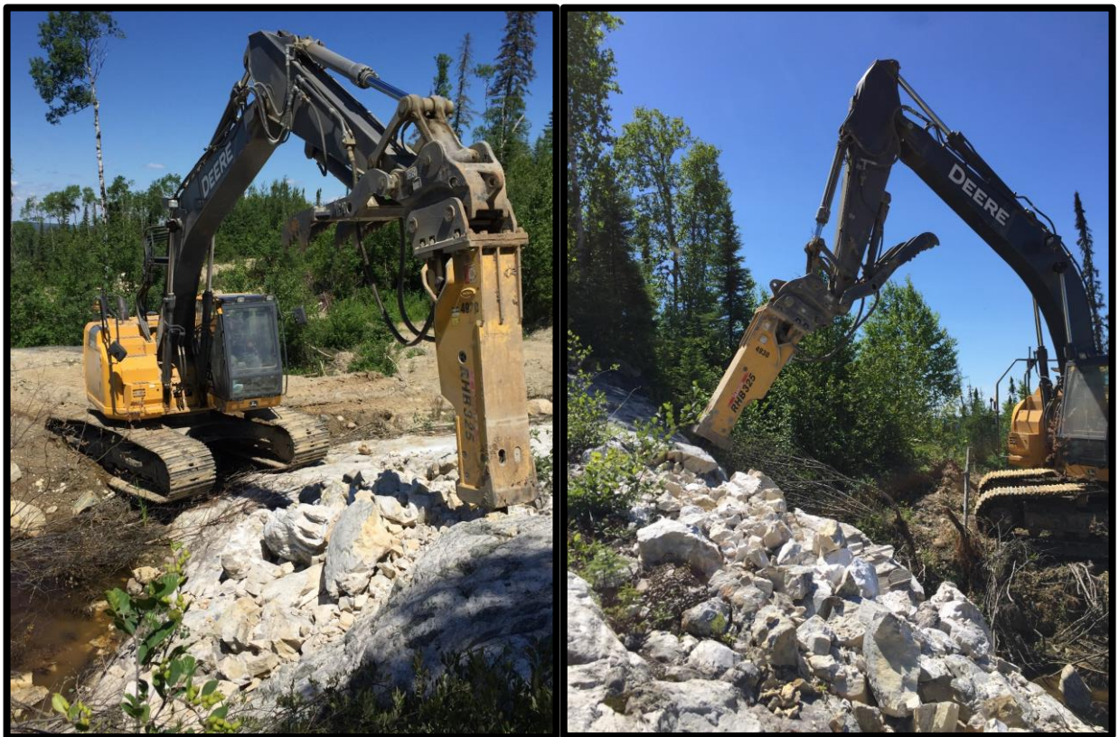
Figure 1. Rock breaker creating a bulk sample at a pegmatite exposure at the North Aubry prospect.

Diversified minerals explorer and developer Ardiden Limited (ASX: ADV) is pleased to confirm that a bulk sample of approximately three tonnes has been obtained from the North Aubry prospect at the 100% owned Seymour Lake Lithium Project in Ontario, Canada.