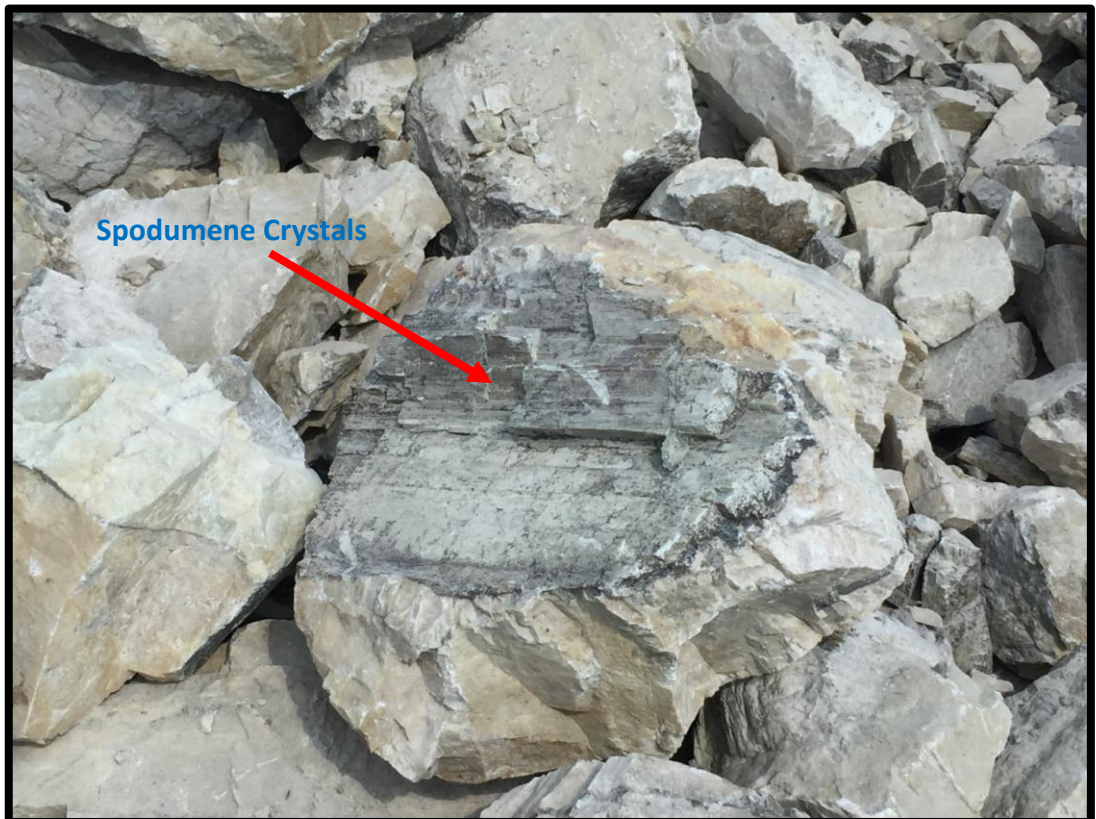
Figure 3. Bulk sample of Spodumene bearing pegmatite obtained from the North Aubry prospect. Highlighted in the image are the large high quality Spodumene crystals.