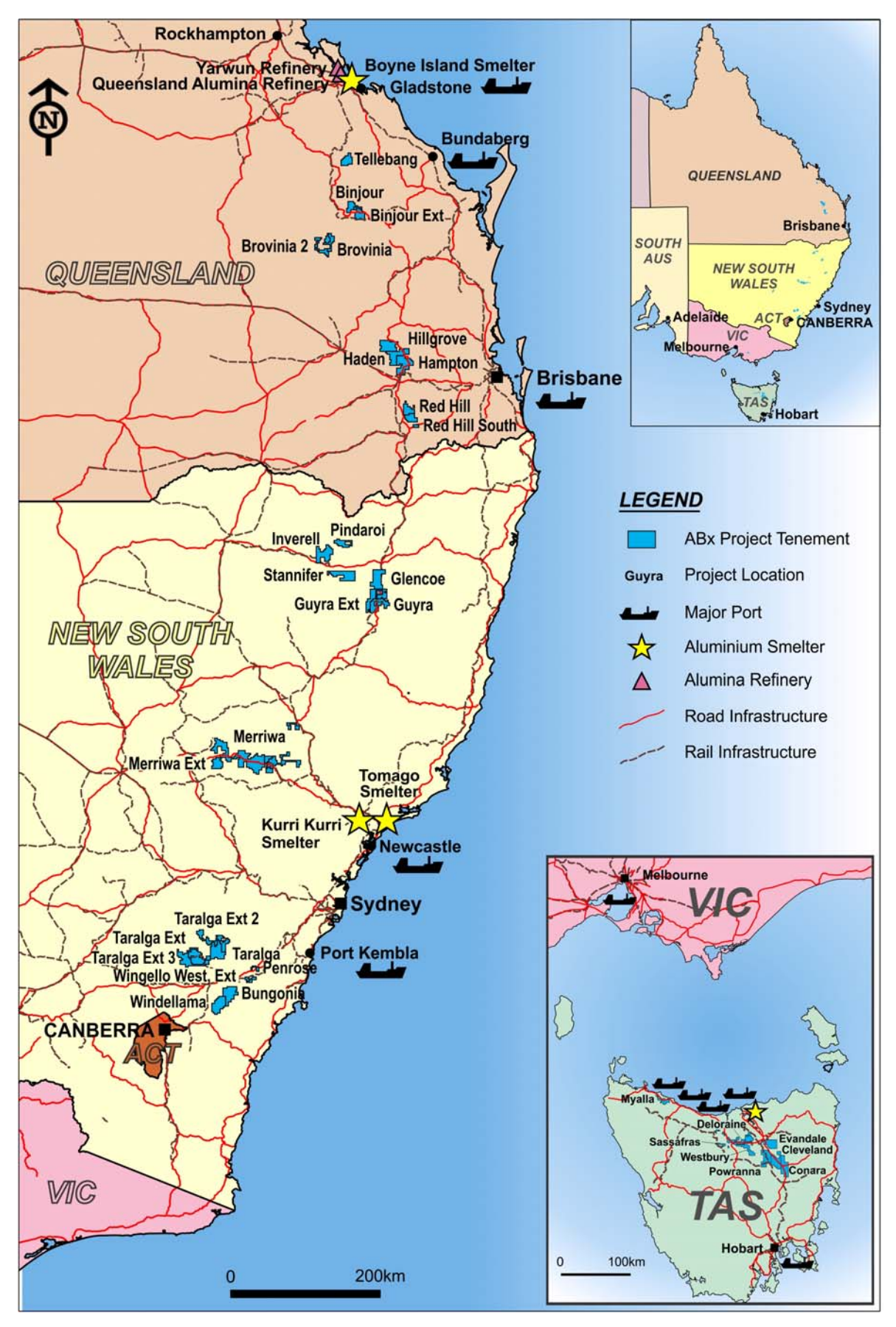
Figure 4: Project Tenements and Major Infrastructure - 3Qtr 2012