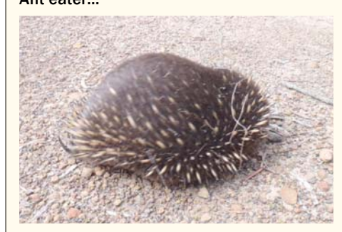
Echidna: (Tachyglossus aculeatus), or spiny ant eater, is familiar to most Australians.

Photographed during detailed fauna survey in Tasmania.