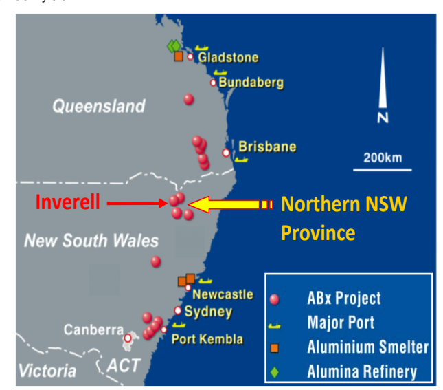
Figure 1: Inverell Project Location

The Inverell bauxite project is located approximately 430kms inland from Newcastle port and is not serviced by a heavy duty rail line. Therefore, this bauxite project is not considered a candidate for early development for direct export. However Inverell may form part of a sizeable bauxite province in northern NSW that has potential to justify a bauxite processing facility, possibly even a new bauxite-alumina refinery.