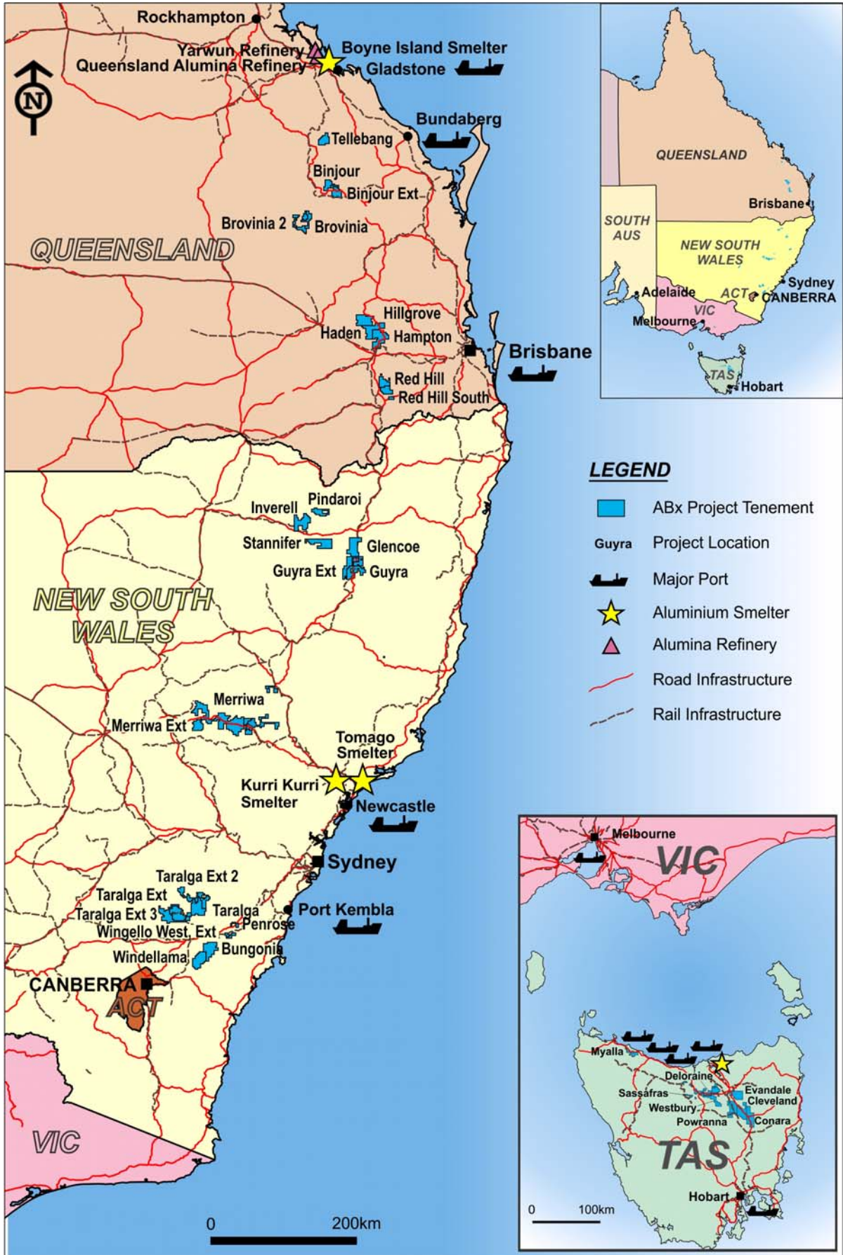
Figure 2: ABx Project Locations