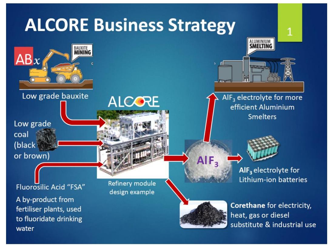
Figure 1: Summary of the ALCORE Business Strategy