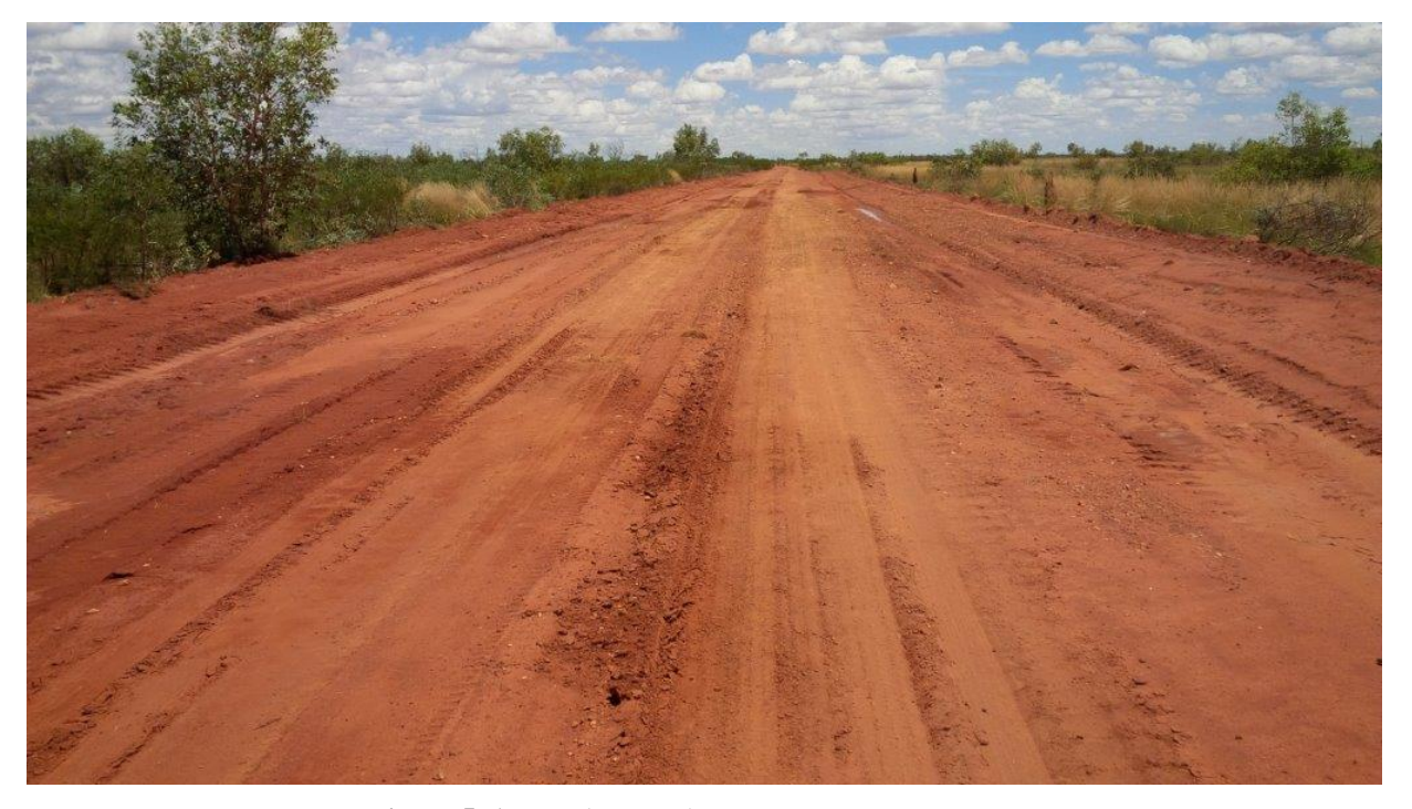
Figure 5. Access (haulage) road graded and prepared

The access road to site has been graded and upgraded. This road will be used as the haul road to the Coyote Gold Plant.