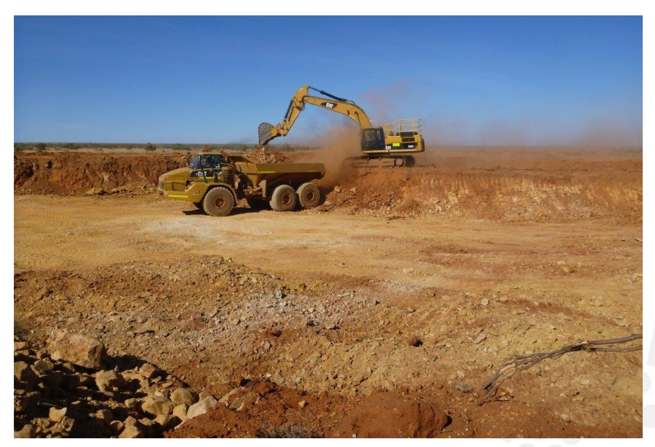
Figure 1. Mining at Old Pirate underway