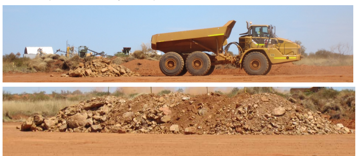
Figure 4. First ore on to the ROM pad

Resource Mining Pty Ltd (our mining contractor) has mobilised to site and site-works are well advanced. The waste rock and initial mining footprint areas have been cleared and the pre-strip mining of waste has commenced. Some surface ore has been moved and stockpiled on the newly formed ROM pad area with mining of ore expected to commence in earnest within 3 weeks.