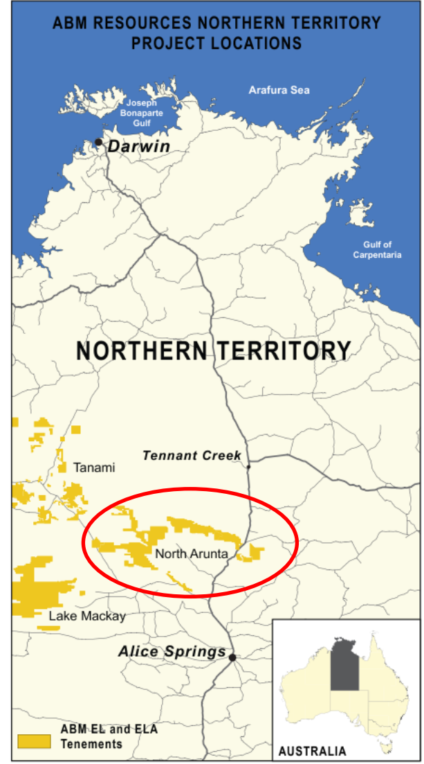
Figure 1. Map of ABM's tenements in the Northern Territory. The North Arunta Project Region is shown in the red oval relative to ABM's Tanami region projects (including Twin Bonanza) and Lake Mackay (optioned by ABM to IGO).