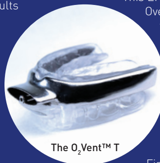
The O 2 Vent™ T

This ERP system ensures that Oventus' US subsidiary is able to access manufacturing, customer management and patient records which is compliant with the US Health Insurance Portability and Accountability Act – a key requirement for managing patient records in the US.