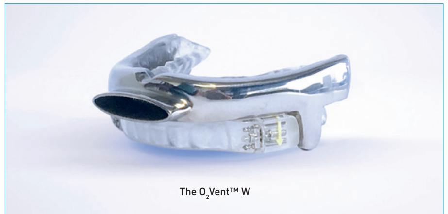
The O 2 Vent™ W

The O 2 Vent™ W uses a dual mechanism to stabilise the jaw and move it forward without locking the upper and lower jaw together. The inclusion of the airway is critical as it bypasses the nose and soft palate, where obstructions are major contributors to OSA. With continued research, this has the potential to change the paradigm of care for patients currently suffering from OSA.