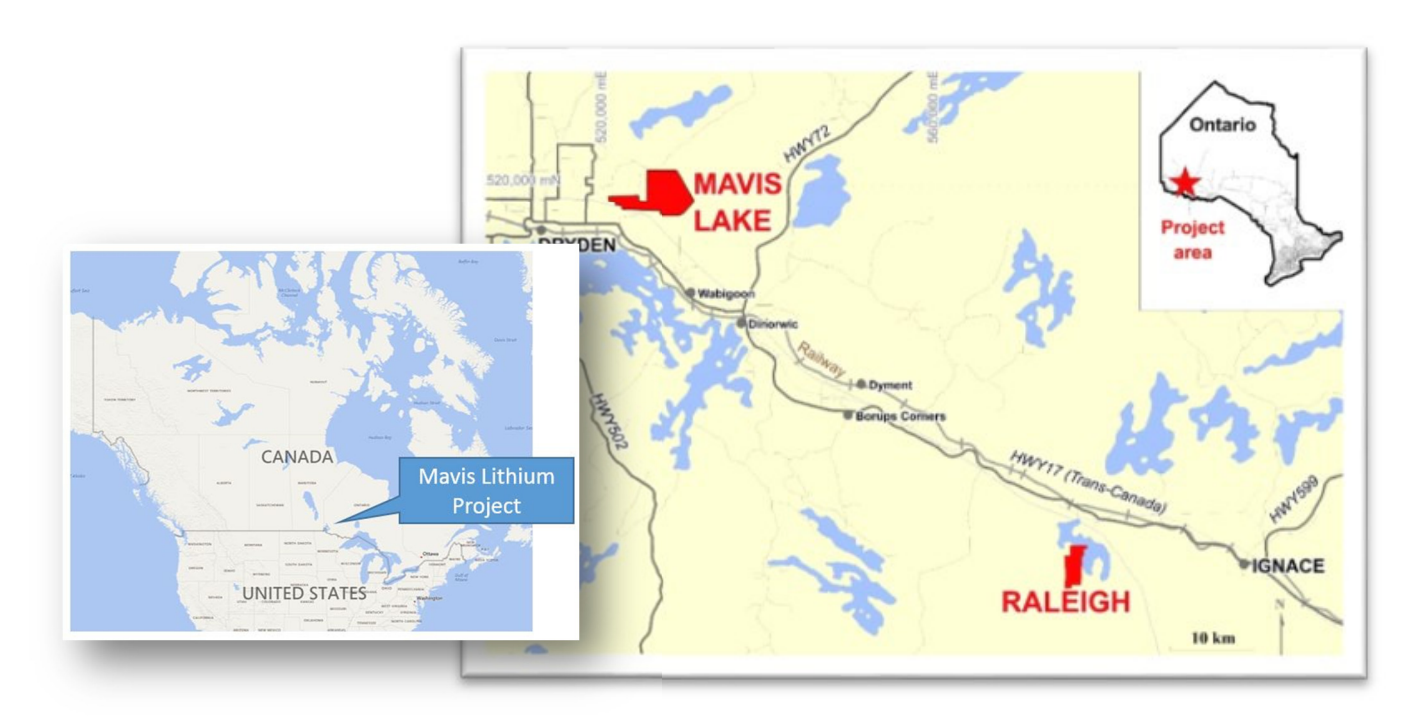
Figure 1. Location of the Mavis Lake and Raleigh Projects.