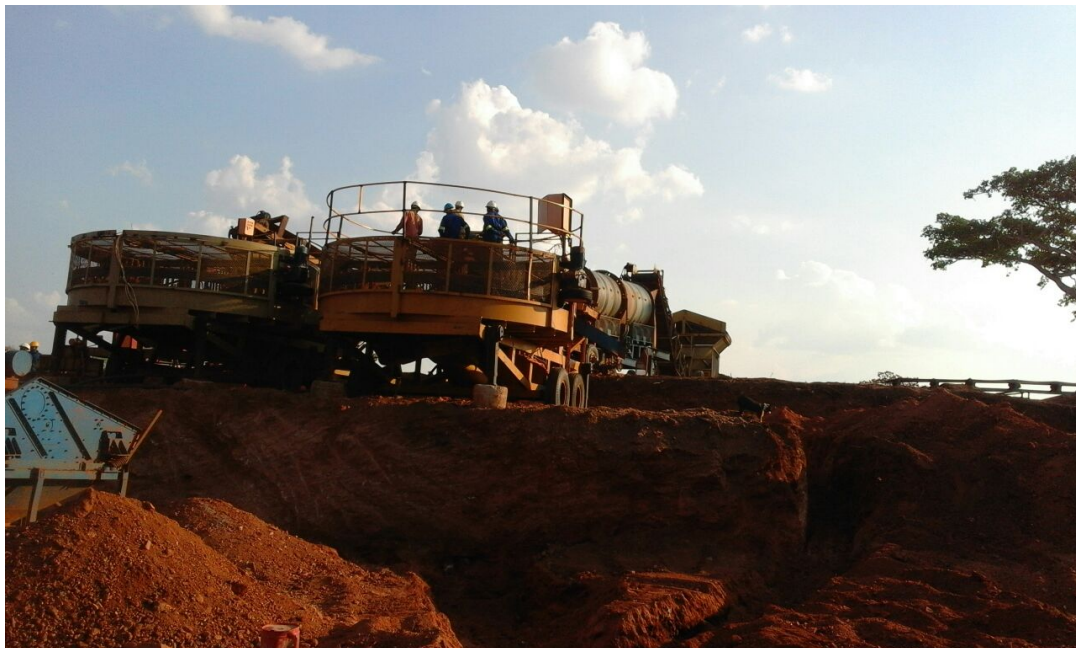
Figure 2. Ruby Processing Plant being installed at new site November 2016