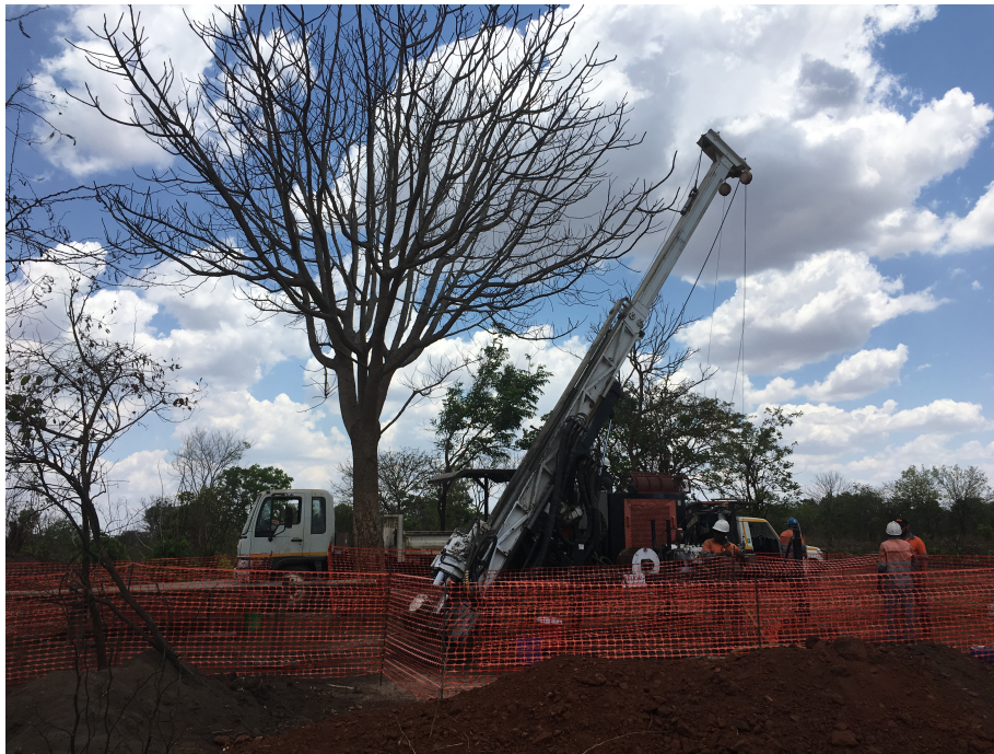
Figure 3. Diamond Drilling at Balama Graphite Project November 2016