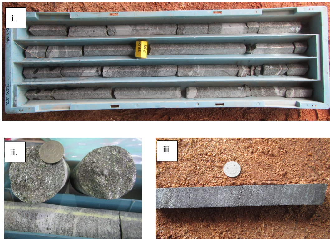
Figure 4. Graphite sample from License 6678L. (i.) Box 22 from 90.20m bottom left to 94m top right; (ii.) graphite at 93m looking down the core; (iii.) quartered graphitic schist at 93m to 93.54m