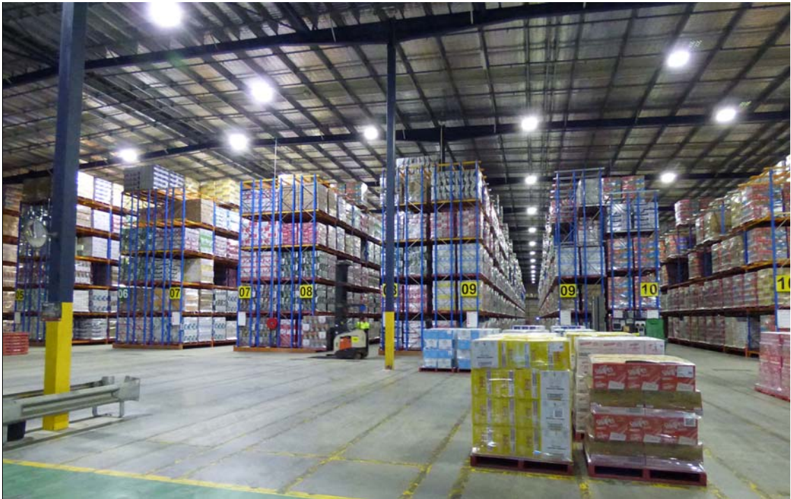
Site after installation of Vivid Industrial's intelligent Matrixx lighting system

The site is a live working facility and the removal and installation of lighting fixtures was accomplished without disruption to operations during a two week period. Feedback from site staff, project managers and independent electrical contractors has been overwhelmingly complimentary. This site was the customer's first full warehouse LED lighting retrofit, in its global portfolio of sites.